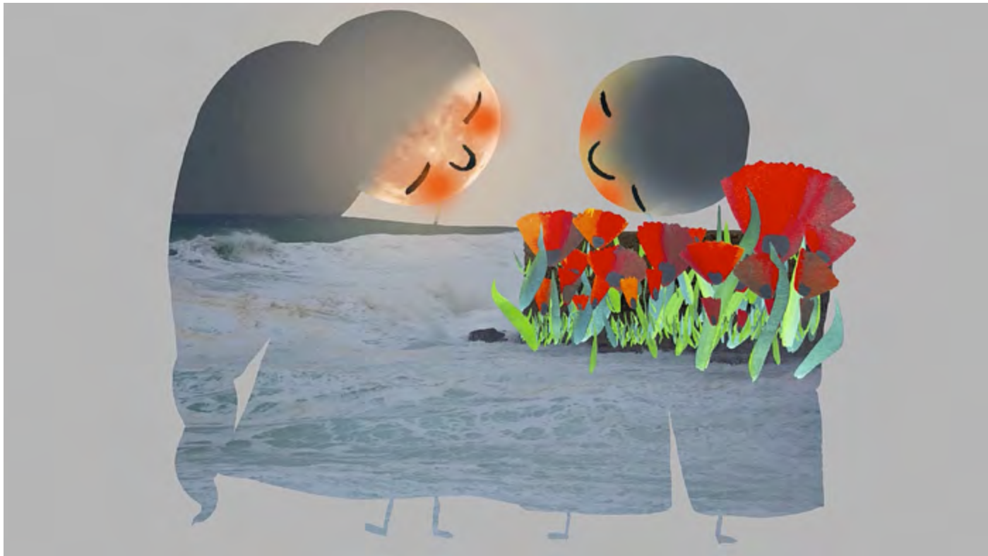
Majd Kurdieh, Al Amar Nawwar / Glowing Moon, Amwaj / Waves Collection, 2021, NFT - available on OpenSea Soundtrack created by Aoun Hamid