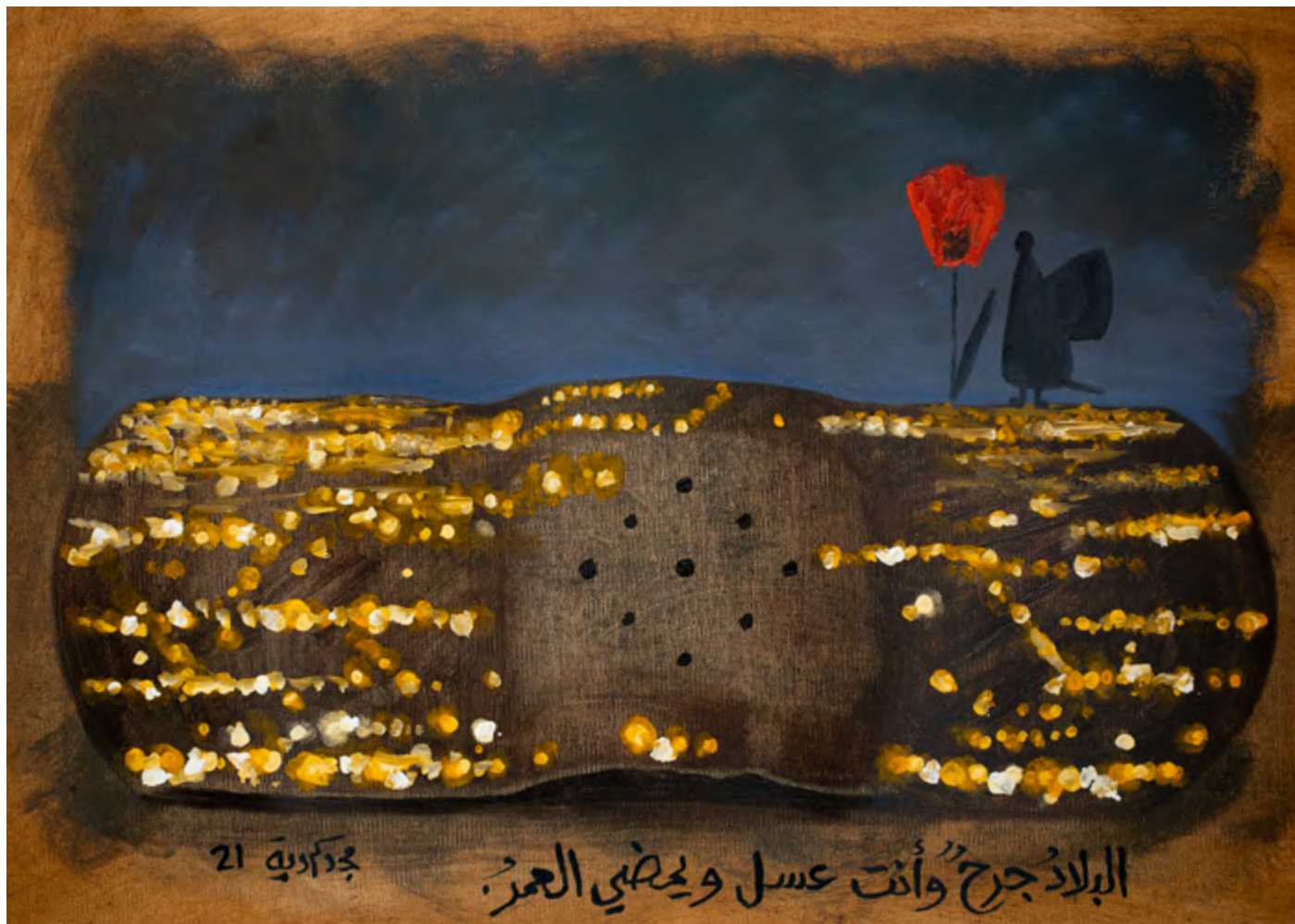
Majd Kurdieh, [The country is the wound and you are the honey and life passes by/moves on], 2021, oil on canvas, 35 x 50 cm EGP 15,400 | USD 980 (+ 14% VAT)