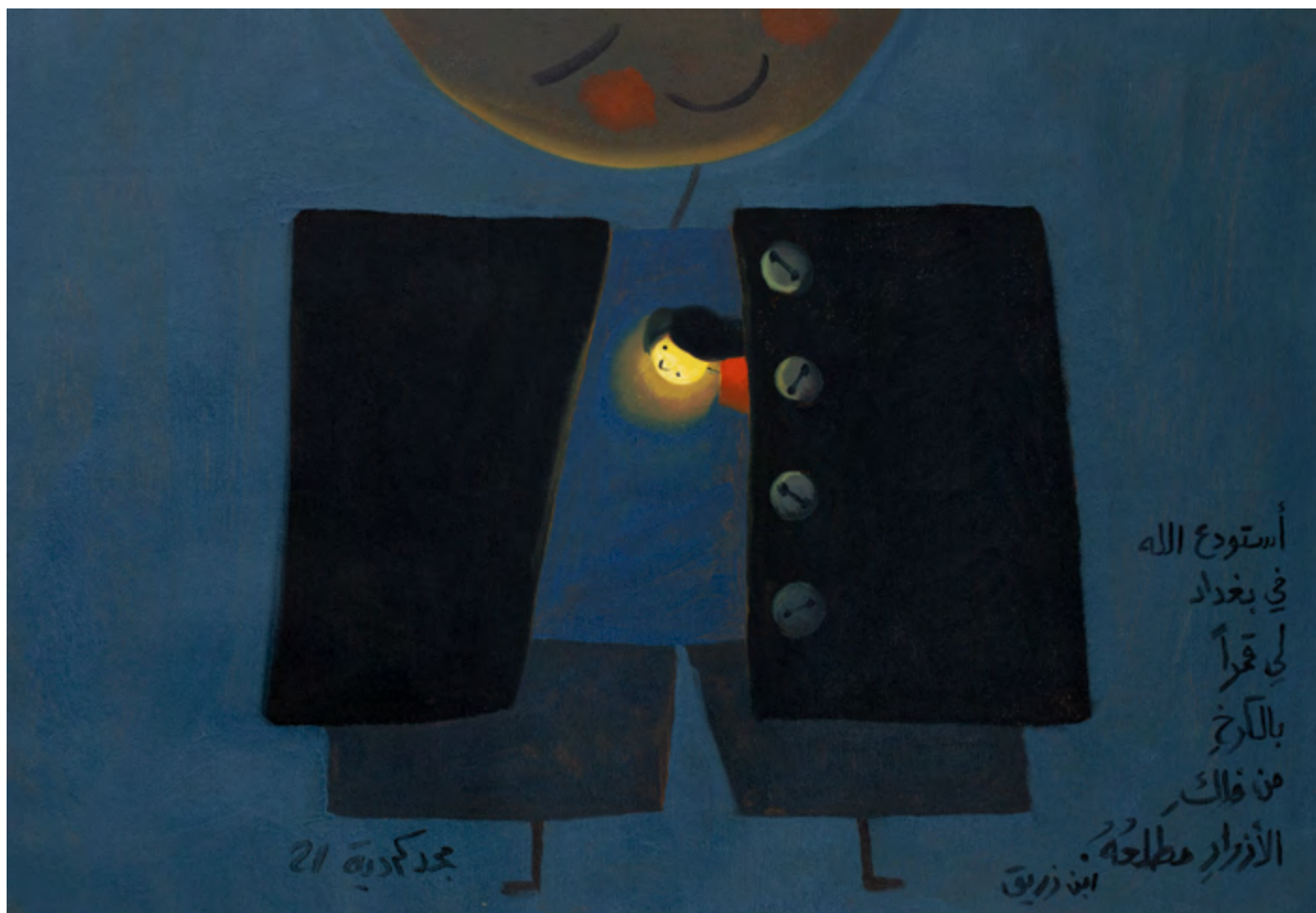
Majd Kurdieh, 2021, oil on canvas, 35 x 50 cm EGP 15,400 | USD 980 (+ 14% VAT)