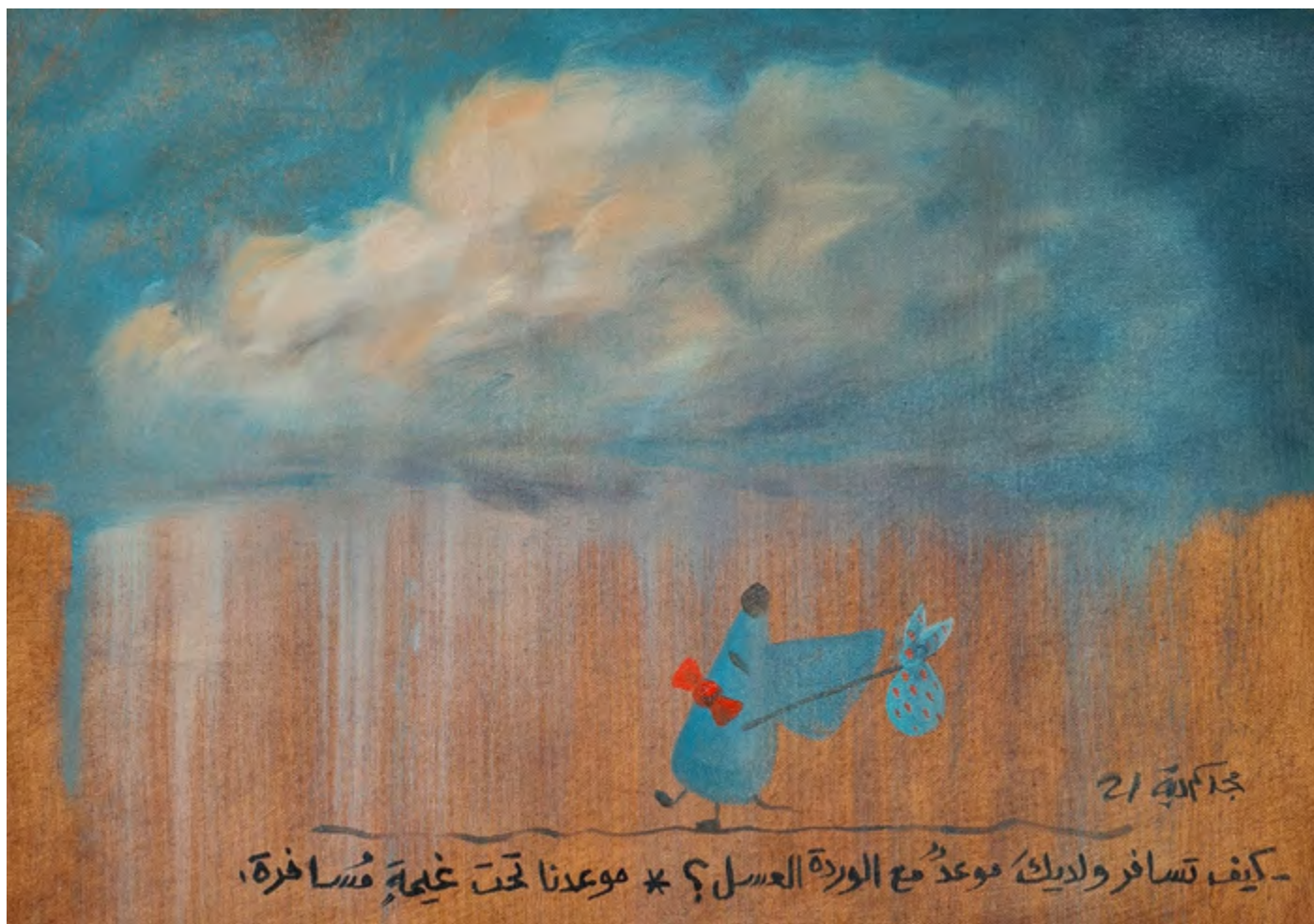
Majd Kurdieh, [- How are you leaving when you have a date with the flower? * Our date is under a travelling cloud], 2021, oil on canvas, 35 x 50 cm EGP 15,400 | USD 980 (+ 14% VAT)