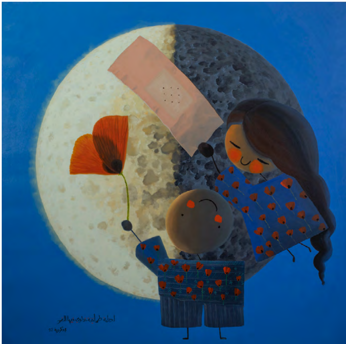
Majd Kurdieh, [A moment of tranquility to cure the moon.], 2022, oil on canvas, 150 x 150 cm EGP 77,000 | USD 4,900 (+ 14% VAT)