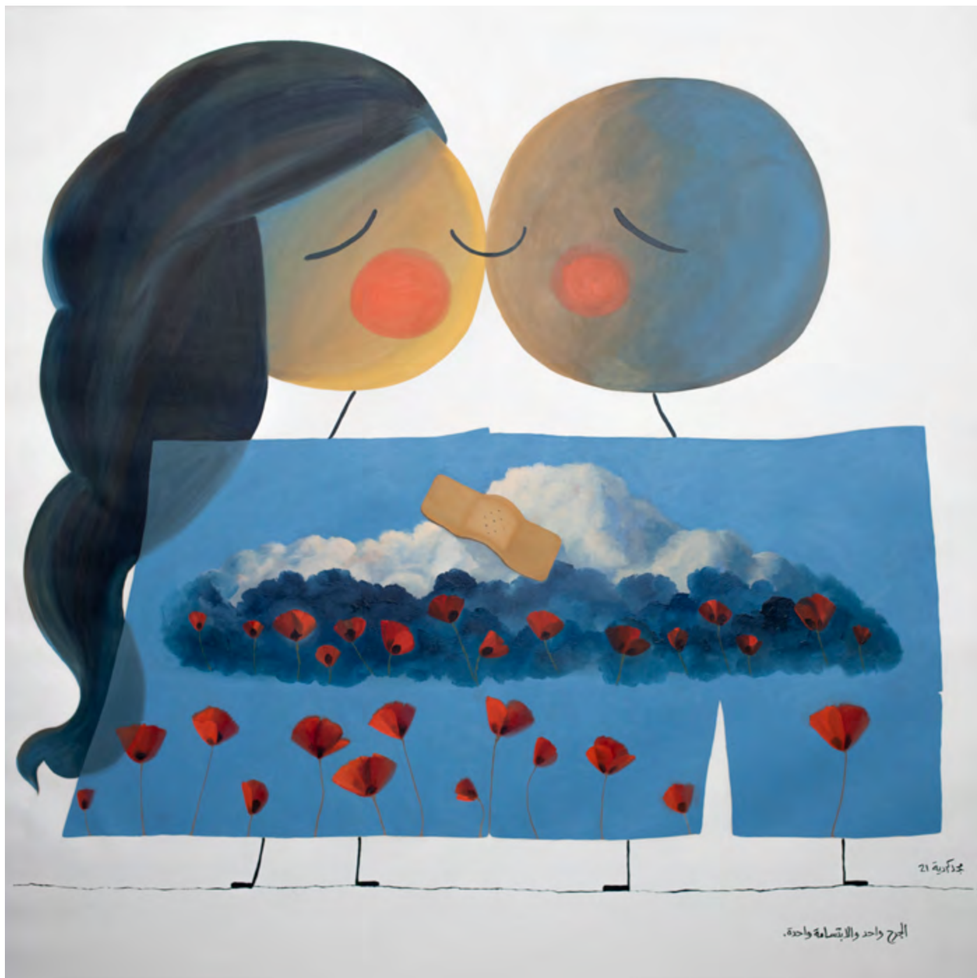
Majd Kurdieh, [One wound, one smile], 2021, oil on canvas, 150 x 150 cm EGP 77,000 | USD 4,900 (+ 14% VAT)