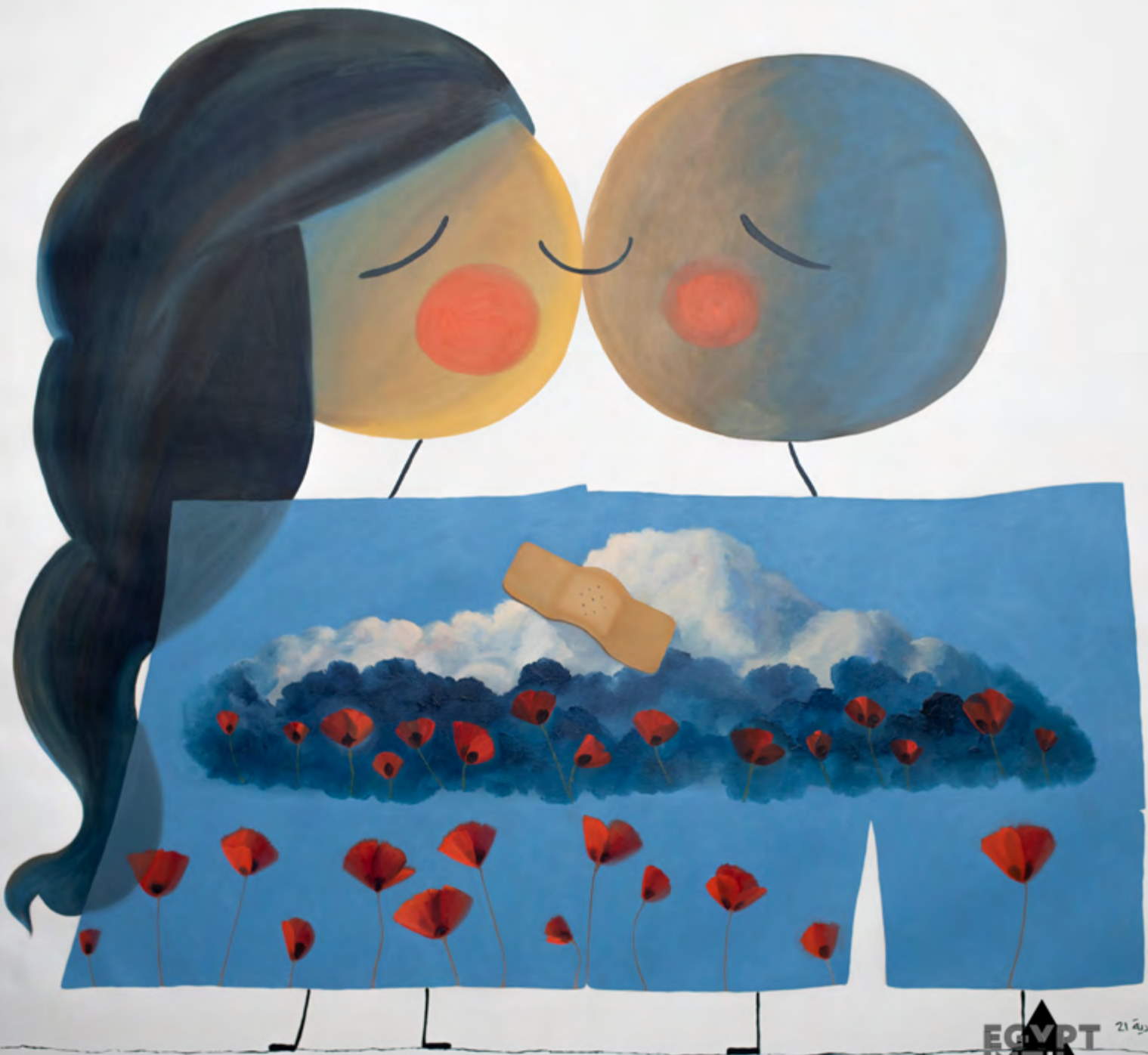
MAJD KURDIEH AT EGYPT INT'L ART FAIR 2022