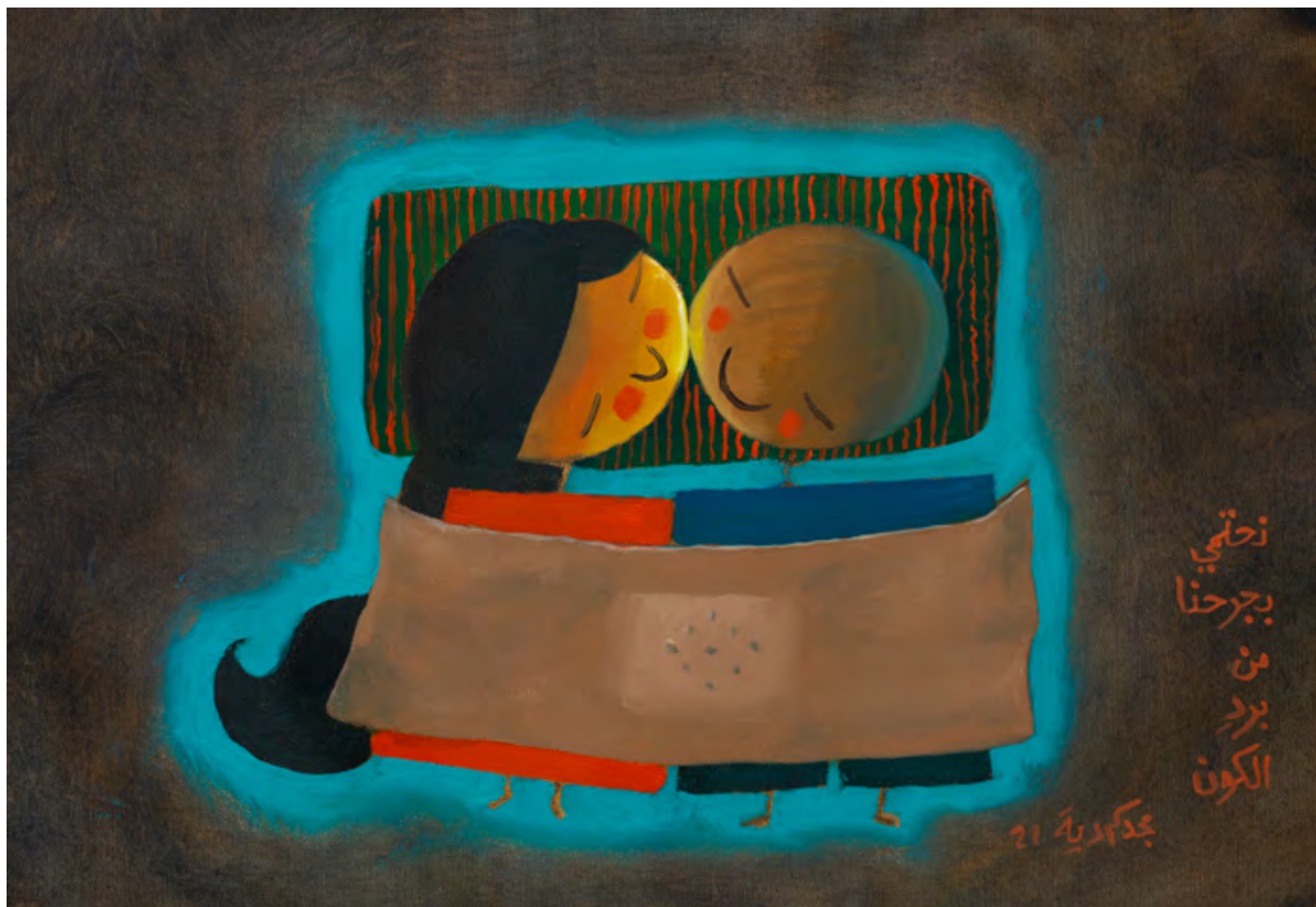
Majd Kurdieh, [We take refuge in our wound from the cold of the universe], 2021, oil on canvas, 35 x 50 cm