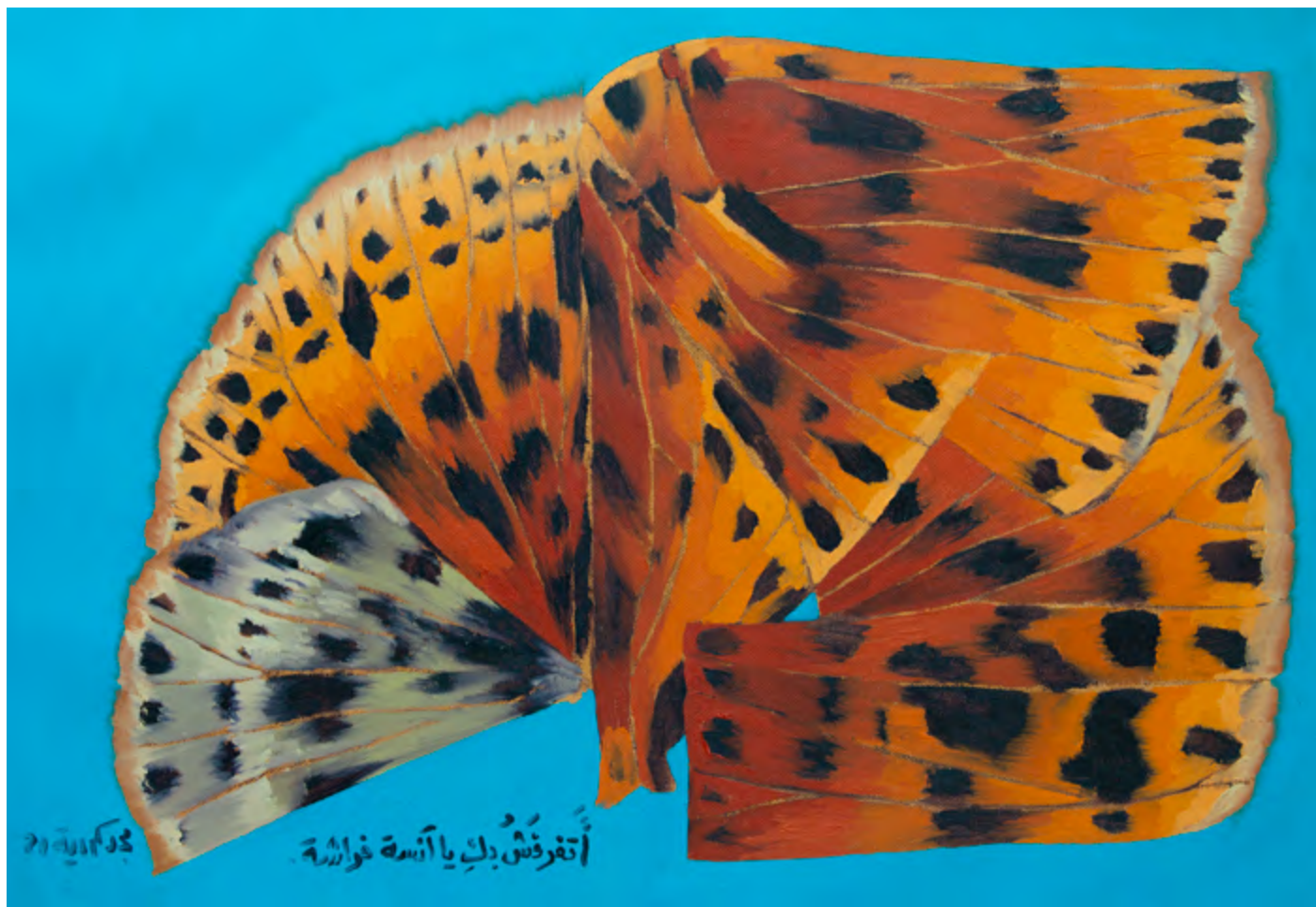
Majd Kurdieh, [You make me happy Miss Butterfly], 2021, oil on canvas, 35 x 50 cm EGP 15,400 | USD 980 (+ 14% VAT)