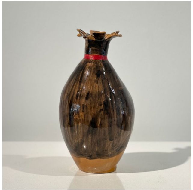
Rabee Kiwan, Untitled from Black series, 2023, ceramic vase, oxide color glaze on kaolin and local Syrian clay, 27 H x 14 D cm