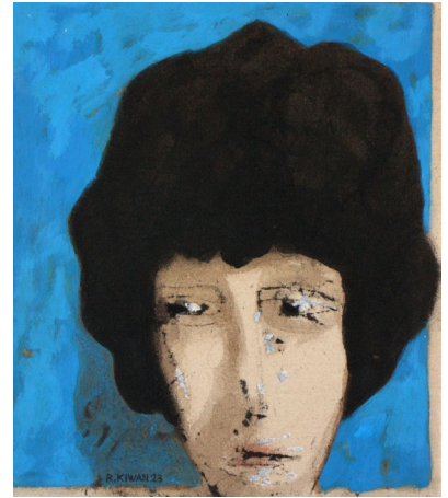
Rabee Kiwan, Untitled from Black series, 2023, acrylic on canvas, 30 x 35 cm