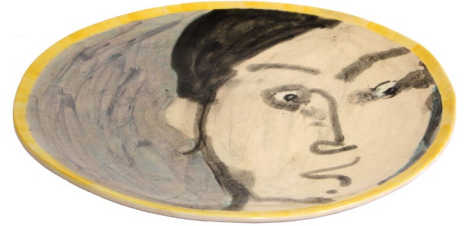
Rabee Kiwan, Untitled from Black series, 2023, ceramic plate, oxide color glaze on kaolin and local Syrian clay, 30 cm diameter