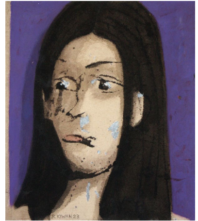
Rabee Kiwan, Untitled from Black series, 2023, acrylic on canvas, 30 x 35 cm