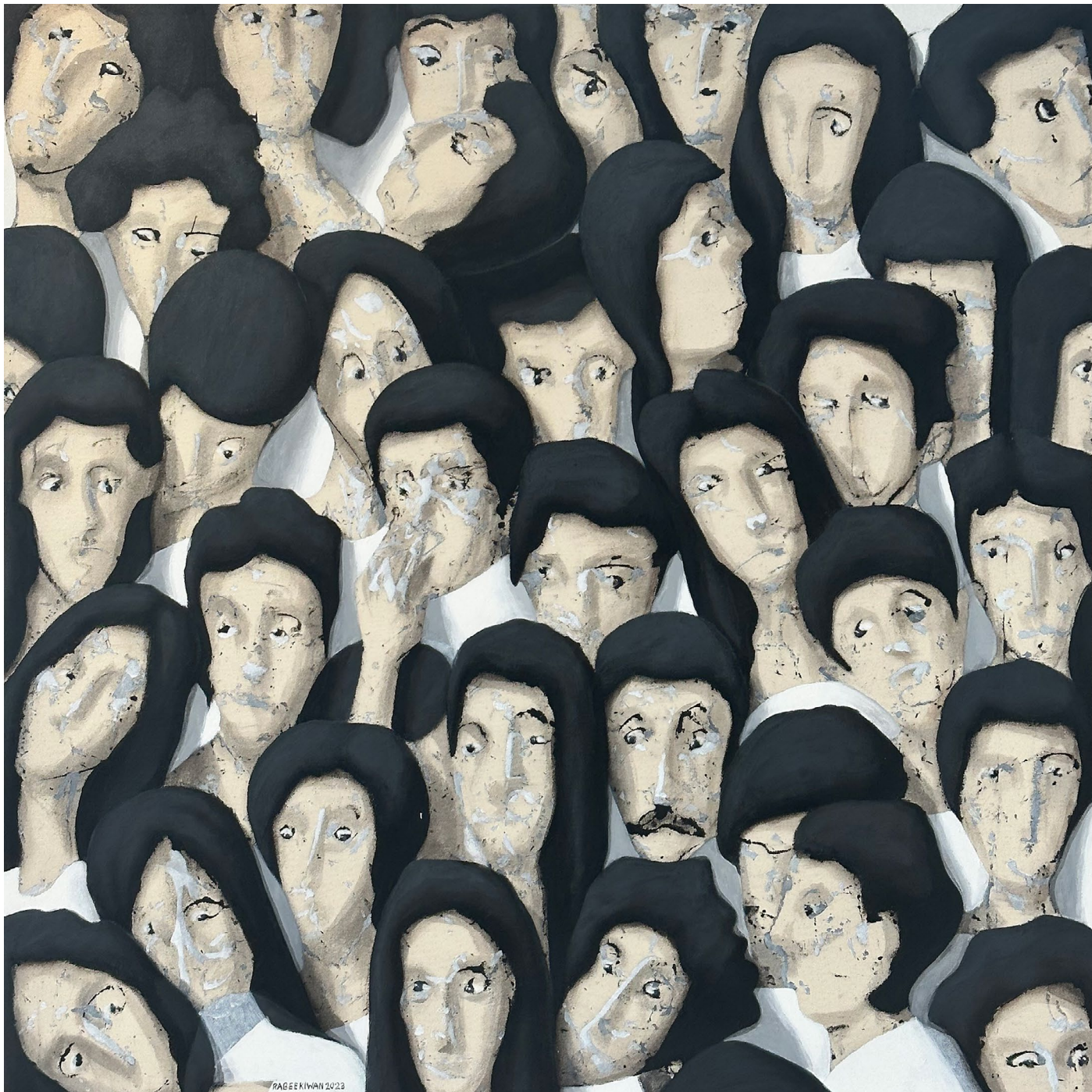
Rabee Kiwan, Untitled from Black series, 2023, acrylic on canvas, 130 x 130 cm