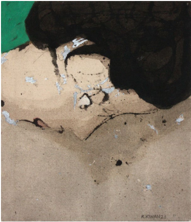
Rabee Kiwan, Untitled from Black series, 2023, acrylic on canvas, 30 x 35 cm