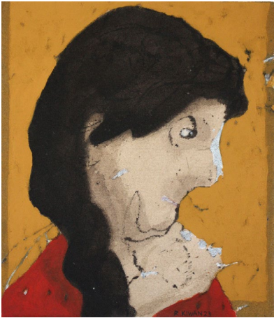
Rabee Kiwan, Untitled from Black series, 2023, acrylic on canvas, 30 x 35 cm