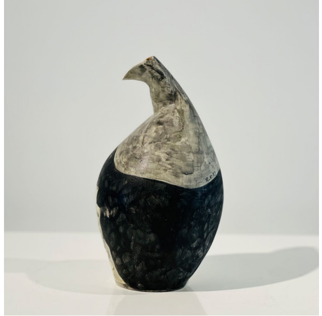
Rabee Kiwan, Untitled from Black series, 2023, ceramic vase, oxide color glaze on kaolin and local Syrian clay, 27 H x 14 D cm