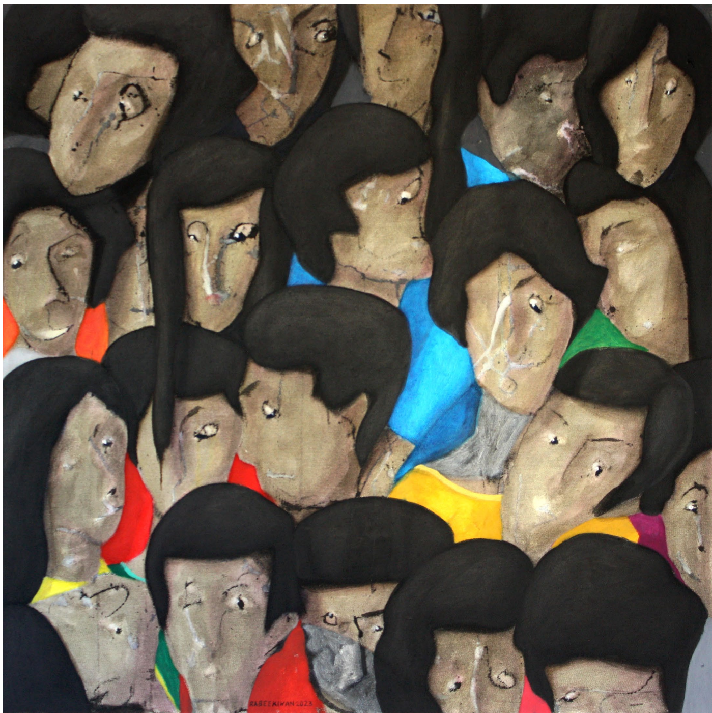
Rabee Kiwan, Untitled from Black series, 2023, acrylic on canvas, 90 x 90 cm