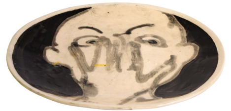
Rabee Kiwan, Untitled from Black series, 2023, ceramic plate, oxide color glaze on kaolin and local Syrian clay, 30 cm diameter