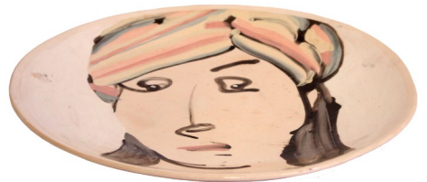
Rabee Kiwan, Untitled from Black series, 2023, ceramic plate, oxide color glaze on kaolin and local Syrian clay, 30 cm diameter