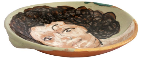
Rabee Kiwan, Untitled from Black series, 2023, ceramic plate, oxide color glaze on kaolin and local Syrian clay, 36 cm diameter