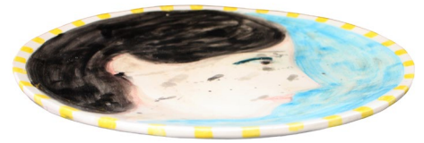
Rabee Kiwan, Untitled from Black series, 2023, ceramic plate, oxide color glaze on kaolin and local Syrian clay, 30 cm diameter