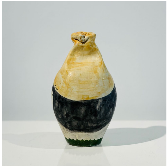
Rabee Kiwan, Untitled from Black series, 2023, ceramic vase, oxide color glaze on kaolin and local Syrian clay, 27 H x 14 D cm