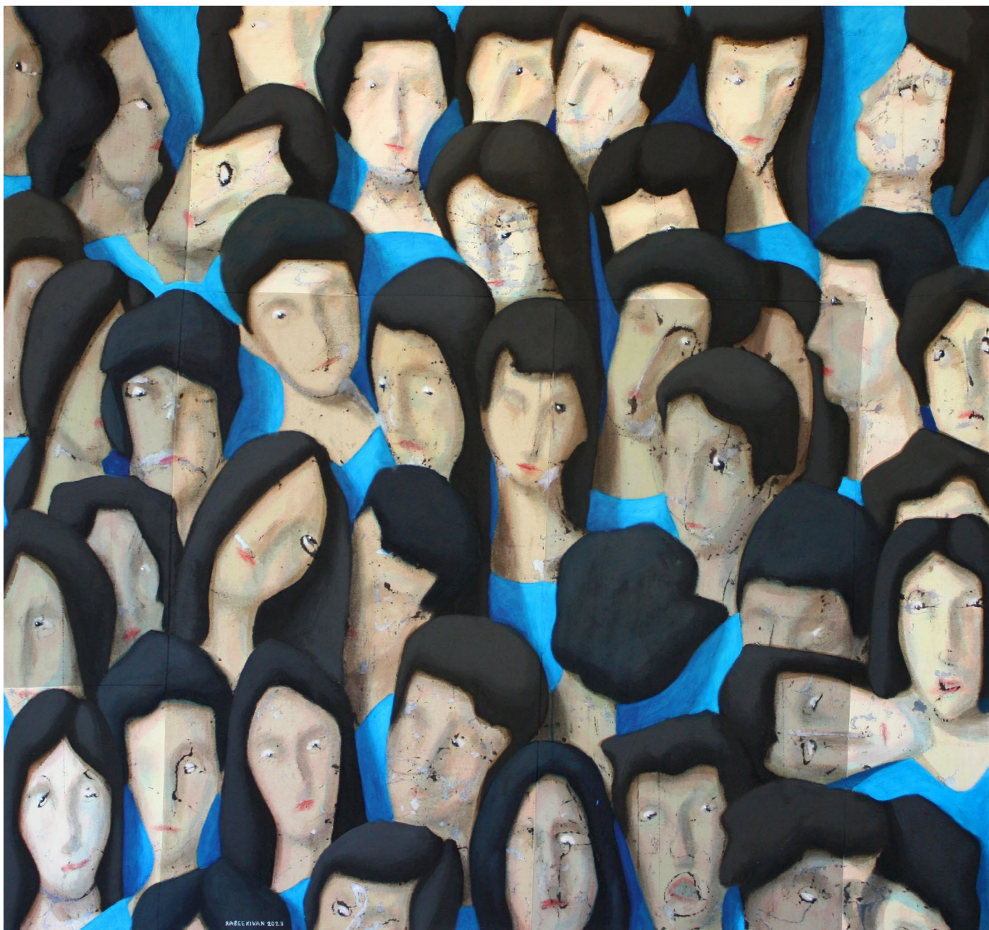
Rabee Kiwan, Untitled from Black series, 2023, acrylic on canvas, 130 x 140 cm