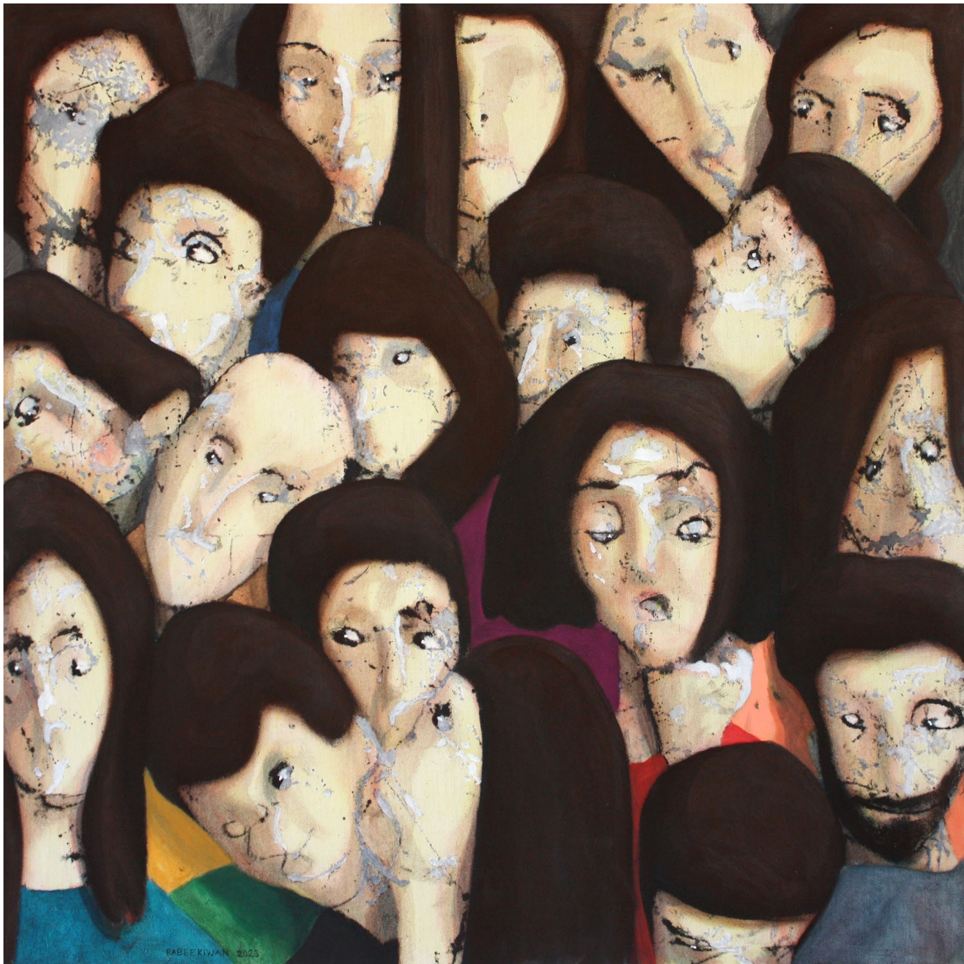
Rabee Kiwan, Untitled from Black series, 2023, acrylic on canvas, 90 x 90 cm