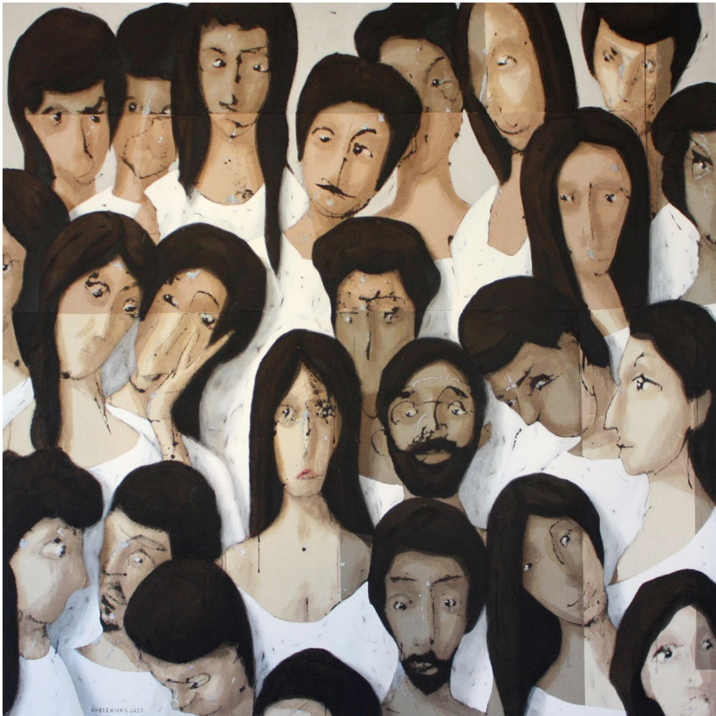
Rabee Kiwan, Untitled from Black series, 2023, acrylic on canvas, 130 x 130 cm