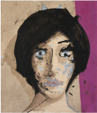
Rabee Kiwan, Untitled from Black series, 2023, acrylic on canvas, 30 x 35 cm