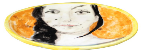
Rabee Kiwan, Untitled from Black series, 2023, ceramic plate, oxide color glaze on kaolin and local Syrian clay, 30 cm diameter