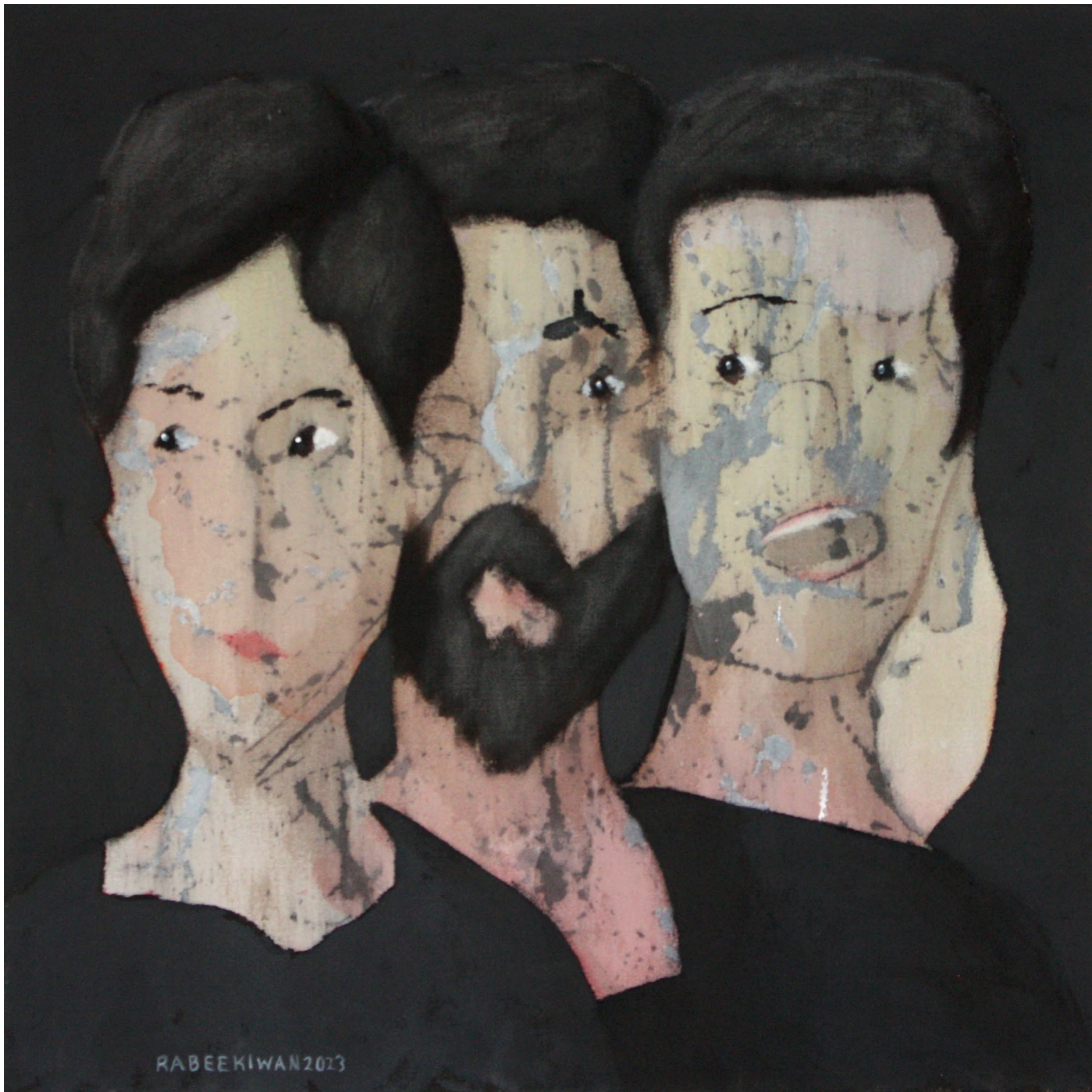
Rabee Kiwan, Untitled from Black series, 2023, acrylic on canvas, 50 x 50 cm