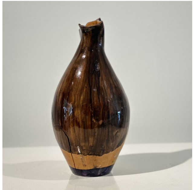
Rabee Kiwan, Untitled from Black series, 2023, ceramic vase, oxide color glaze on kaolin and local Syrian clay, 27 H x 14 D cm