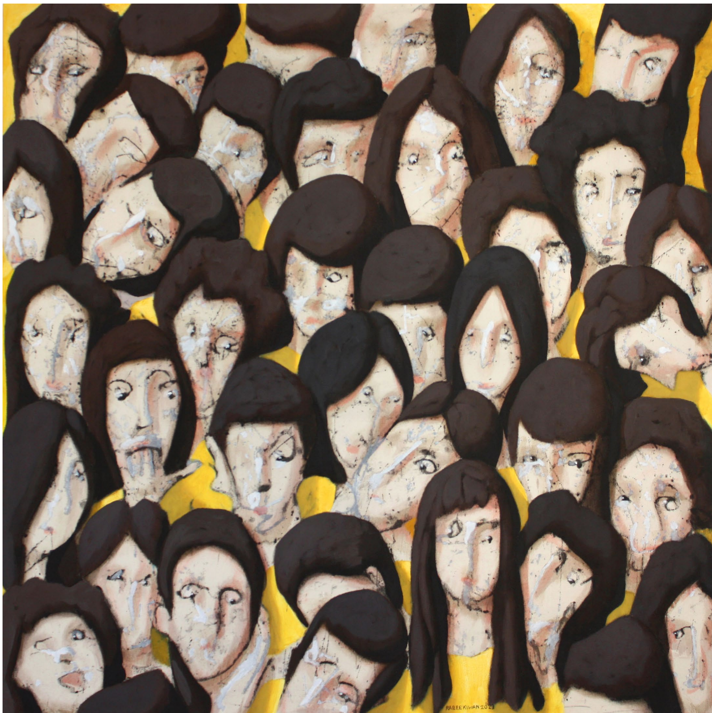
Rabee Kiwan, Untitled from Black series, 2023, acrylic on canvas, 130 x 130 cm