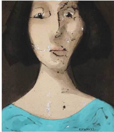
Rabee Kiwan, Untitled from Black series, 2023, acrylic on canvas, 30 x 35 cm