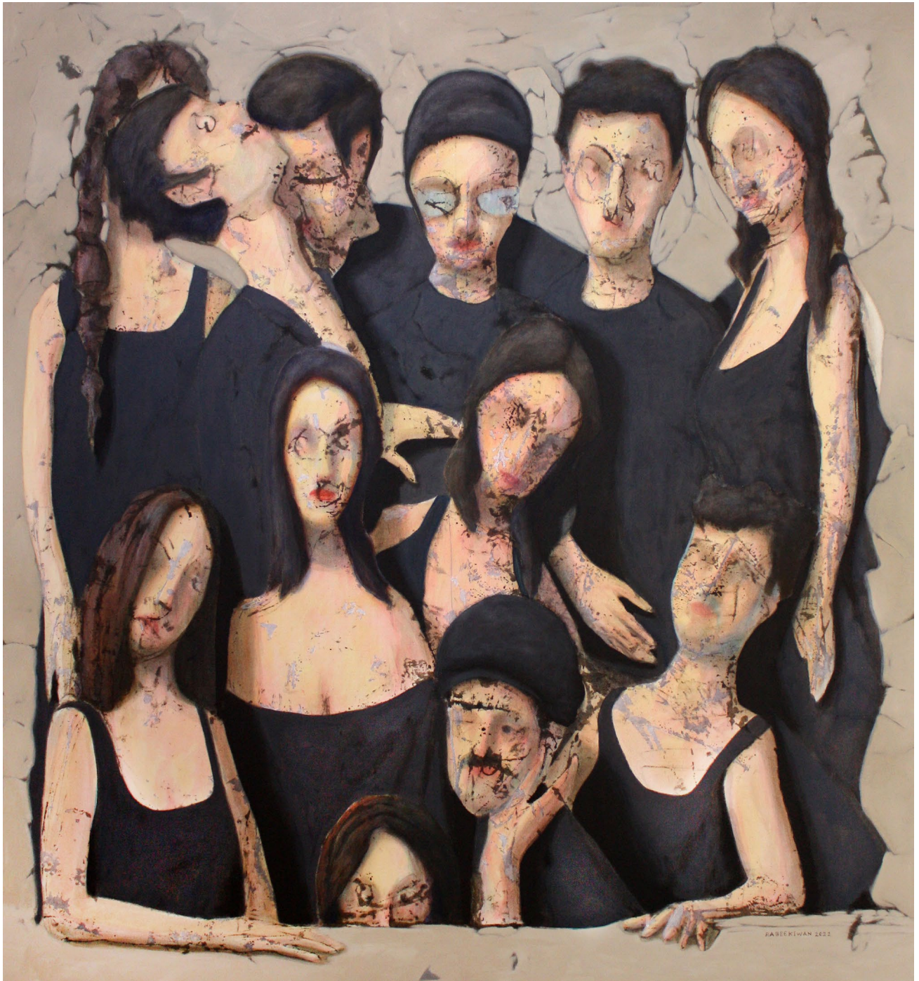
Rabee Kiwan, Untitled from Black series, 2023, acrylic on canvas, 130 x 140 cm