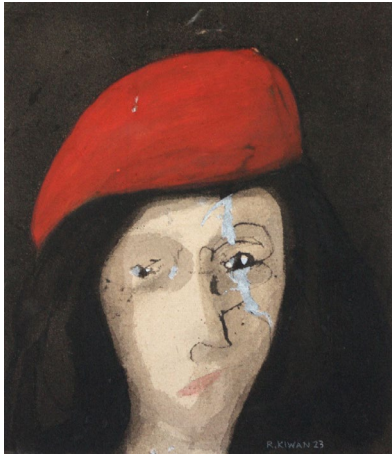
Rabee Kiwan, Untitled from Black series, 2023, acrylic on canvas, 30 x 35 cm