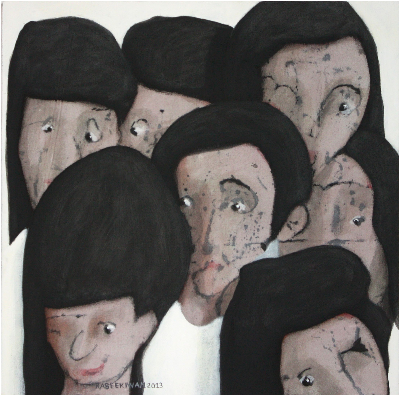
Rabee Kiwan, Untitled from Black series, 2023, acrylic on canvas, 50 x 50 cm