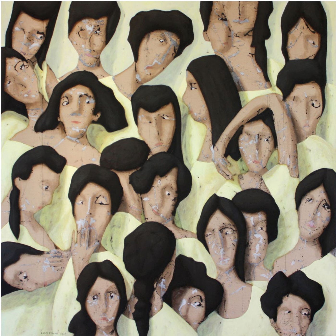
Rabee Kiwan, Untitled from Black series, 2023, Acrylic on canvas, 130 x 130 cm