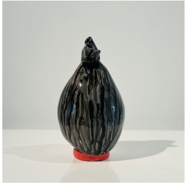
Rabee Kiwan, Untitled from Black series, 2023, ceramic vase, oxide color glaze on kaolin and local Syrian clay, 27 H x 14 D cm