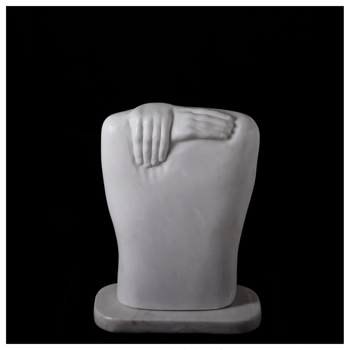
Bader Mahasneh, Untitled from Chaos series, 2013, Carrara Marble, 39 \times 28.5 \times 14 cm