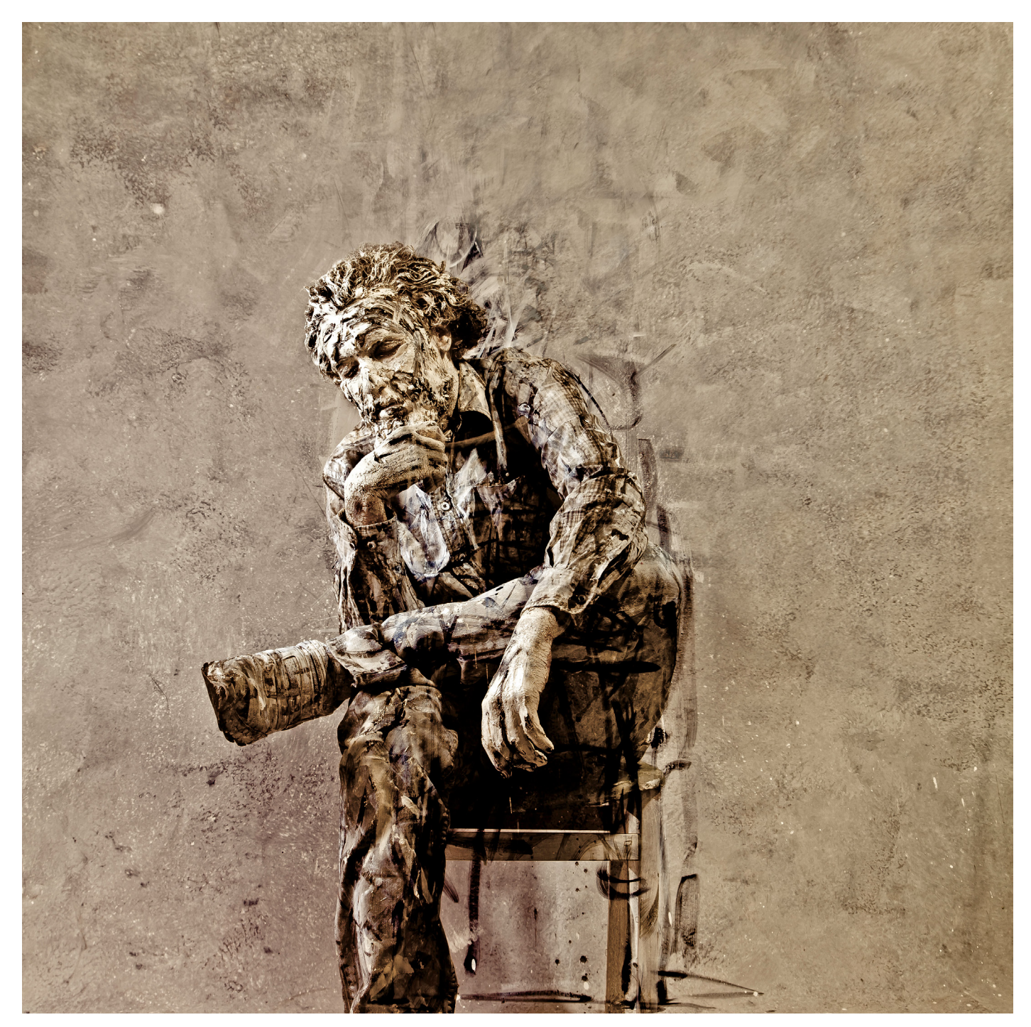
Bader Mahasneh, 2010, Digital print on photo paper, 100 x 100 cm, edition 1 of 3 \, AED 11,000 | USD 3,000 \,