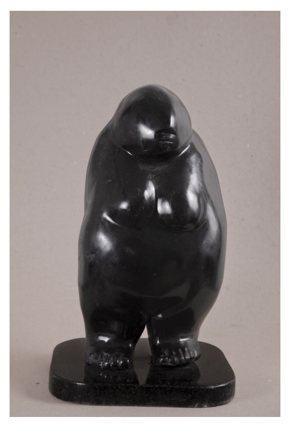
Bader Mahasneh, Untitled from Chaos series, 2013, Gabbro Stone 36 \times 25 \times 25 cm