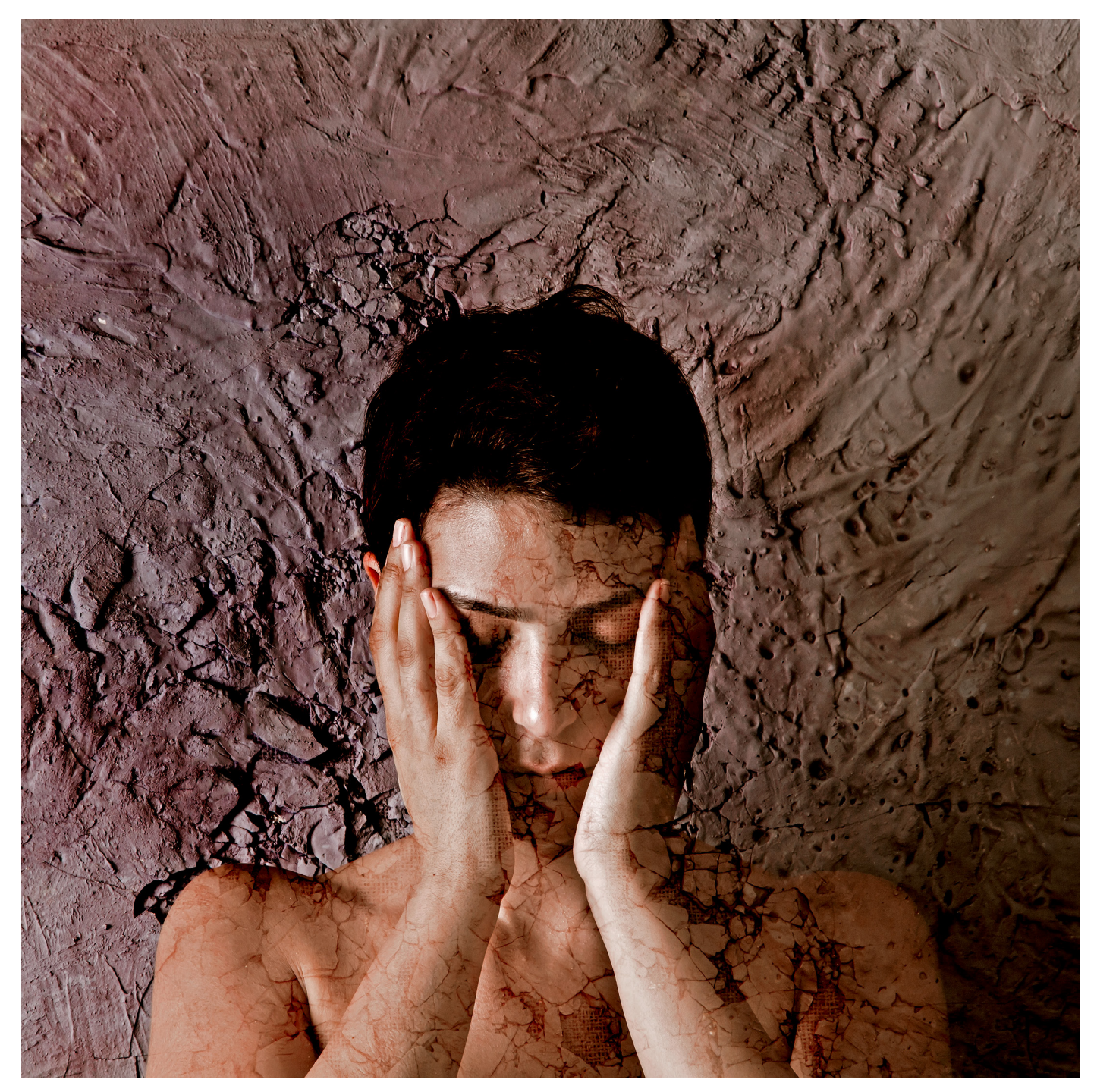
Bader Mahasneh, 2011, Digital print on photo paper, 60 x 60 cm, edition 1 of 3 AED 2,500 | USD 700