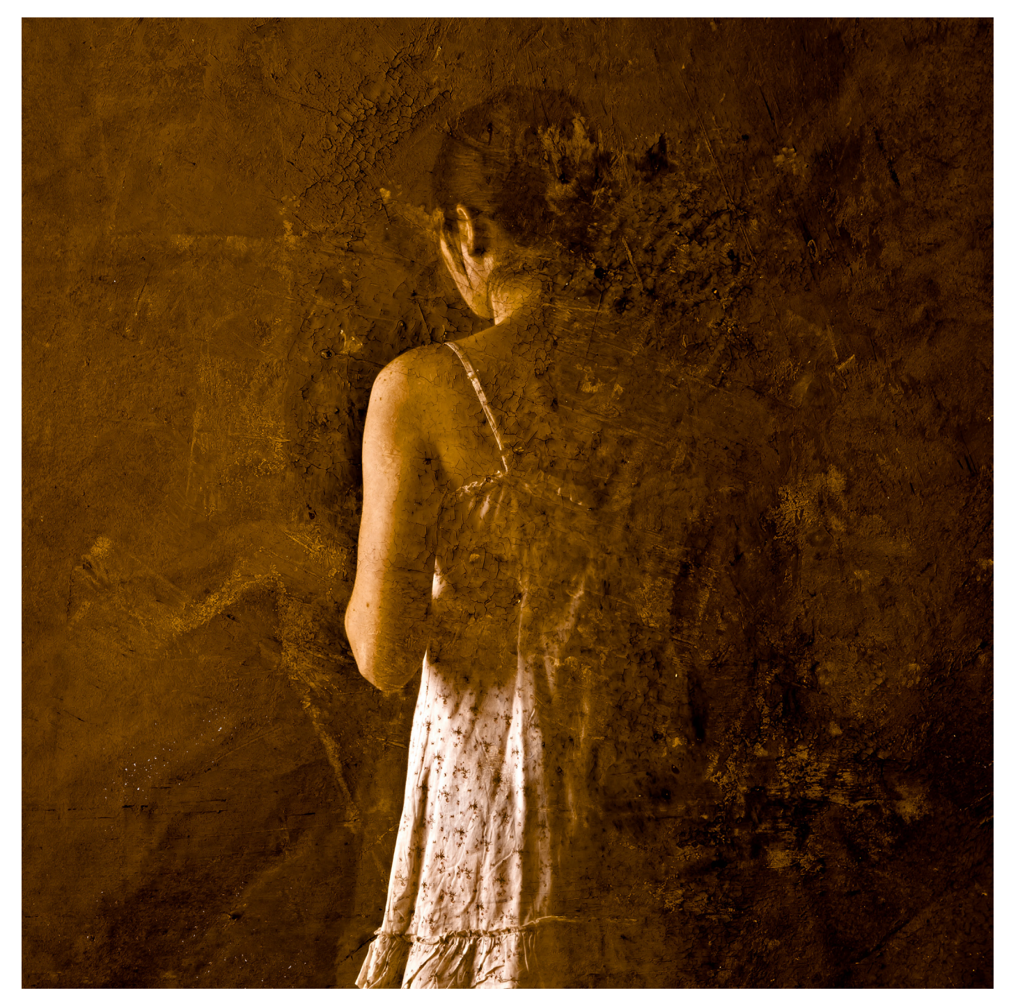
Bader Mahasneh, 2010, Digital print on photo paper, 100 x 100 cm, edition 1 of 3 \, AED 11,000 | USD 3,000 \,