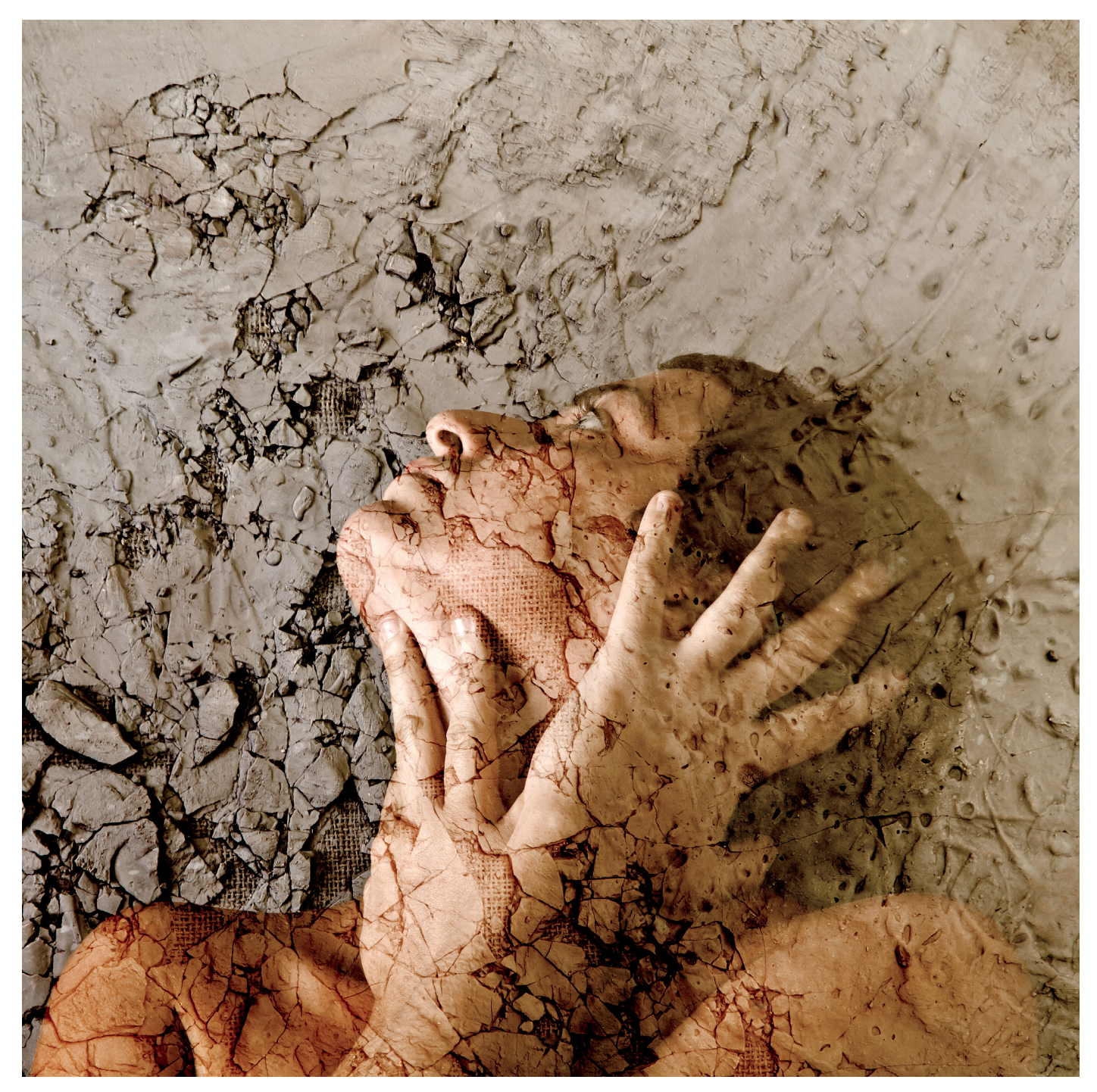
Bader Mahasneh, 2011, Digital print on photo paper, 60 x 60 cm, edition 1 of 3 AED 2,500 | USD 700