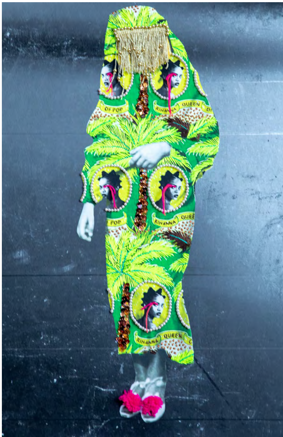
Azaidé, Bint Al Almas , 2023, mixed media on canvas, 120 x 80 cm, Limited Edition 1 of 8