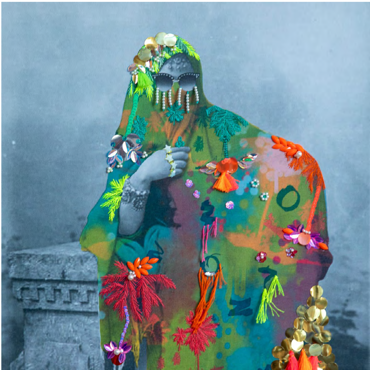
Azaïdé, El Miami , 2023, mixed media on canvas, 90 x 70 cm, Limited Edition 2 of 8