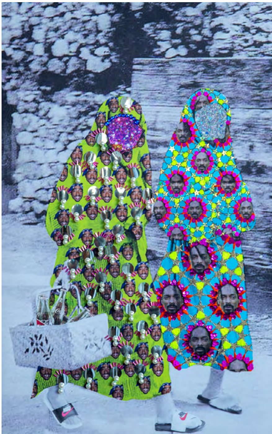
Azaidé, Big Hessa and MC Nadia , 2023, mixed media on canvas, 70 x 45 cm, Limited Edition 2 of 8