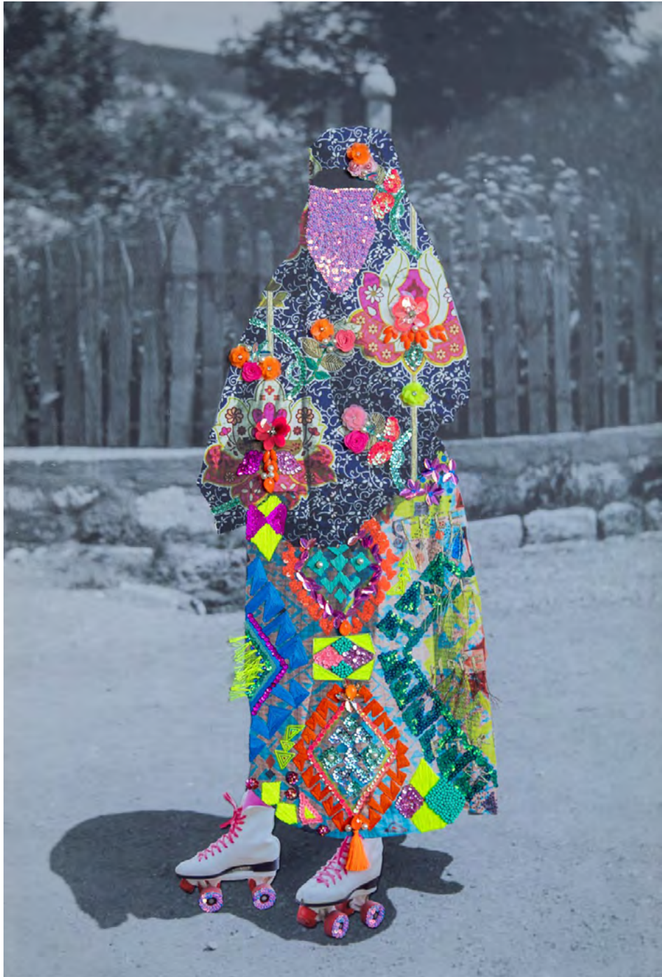
Azaidé, Lil Aisha , 2023, mixed media on canvas, 120 x 80 cm, Limited Edition 7 of 8