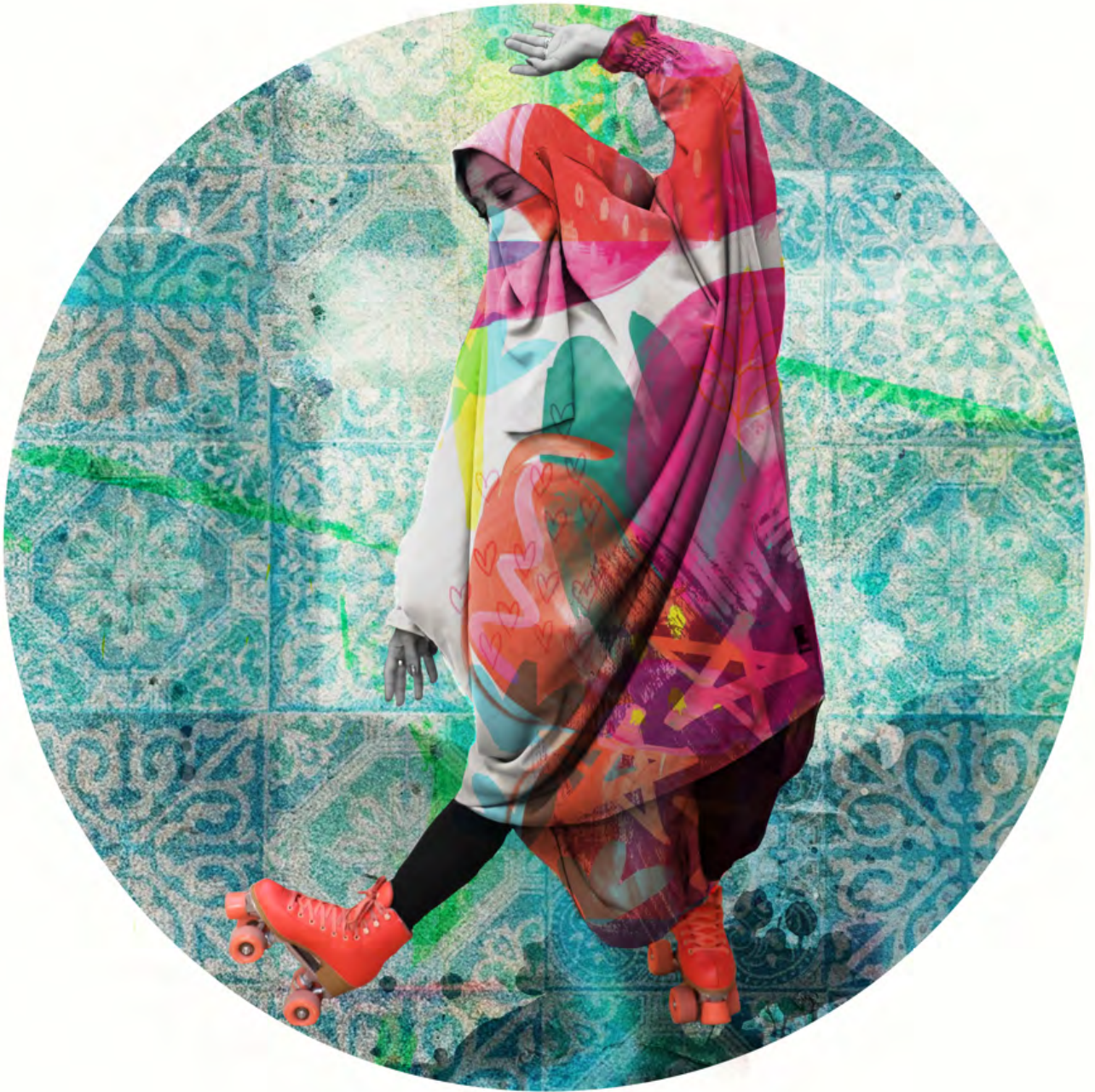
Azaidé, Be Hype , 2023, mixed media on canvas, 50 cm diameter, Limited Edition 1 of 8