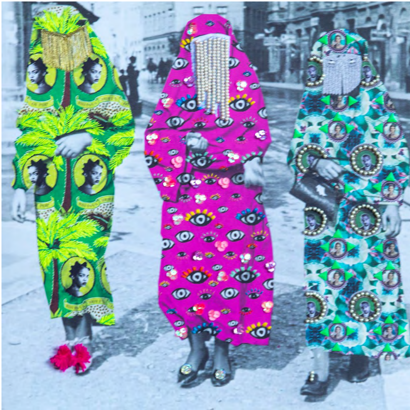
Azaïdè, In The Hood , 2023, mixed media on canvas, 40 x 40 cm, Limited Edition 2 of 8