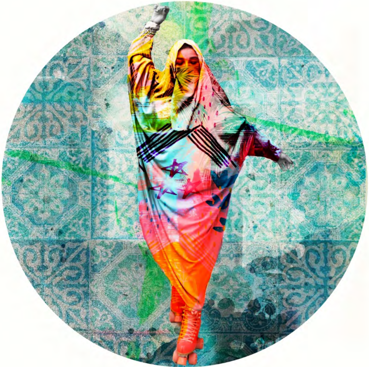
Azaïdé, Be Free , 2023, mixed media on canvas, 50 cm diameter, Limited Edition 1 of 8