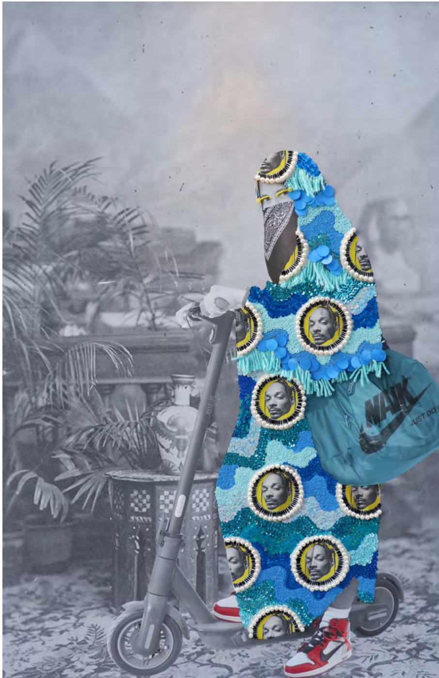
Azaidé, Hustla Huda , 2023, mixed media on canvas, 120 x 80 cm, Limited Edition 1 of 8