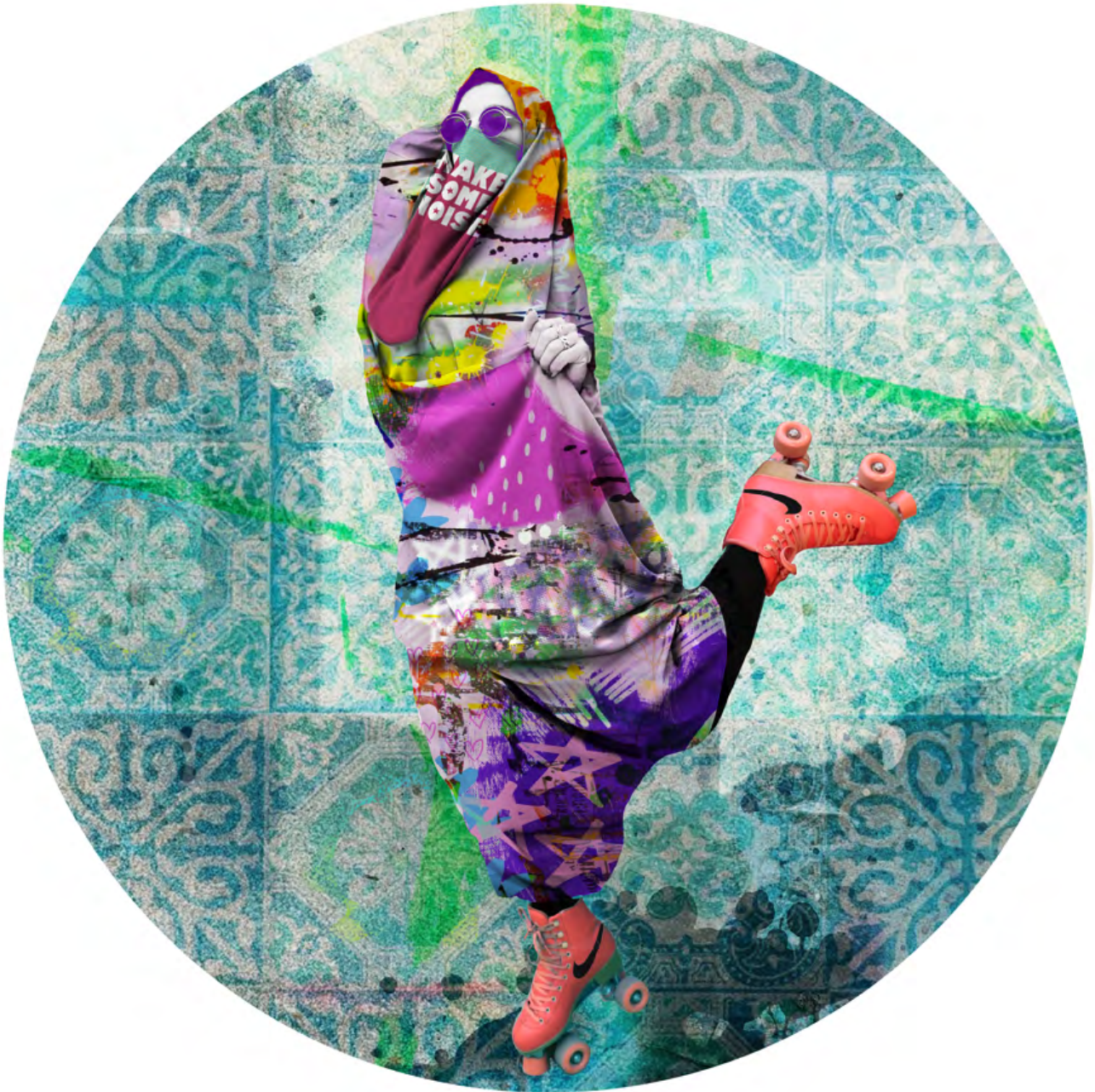
Azaïdé, Be Wild , 2023, mixed media on canvas, 50 cm diameter, Limited Edition 1 of 8