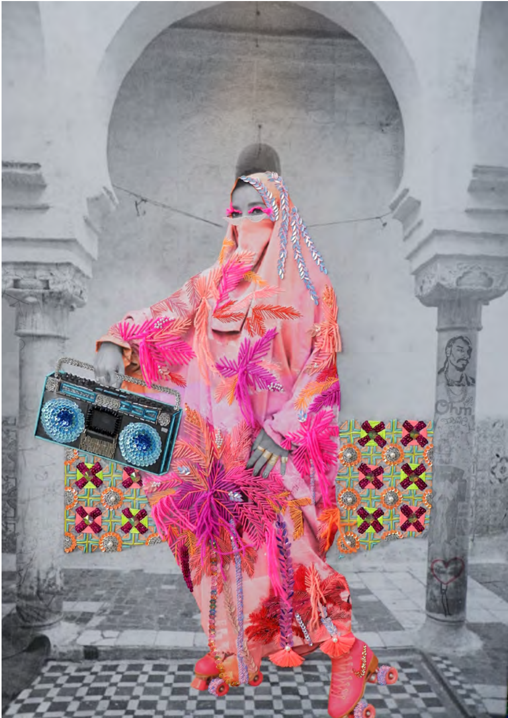
Azaidé, Lil Fatima , 2023, mixed media on canvas, 120 x 80 cm, Limited Edition 2 of 8