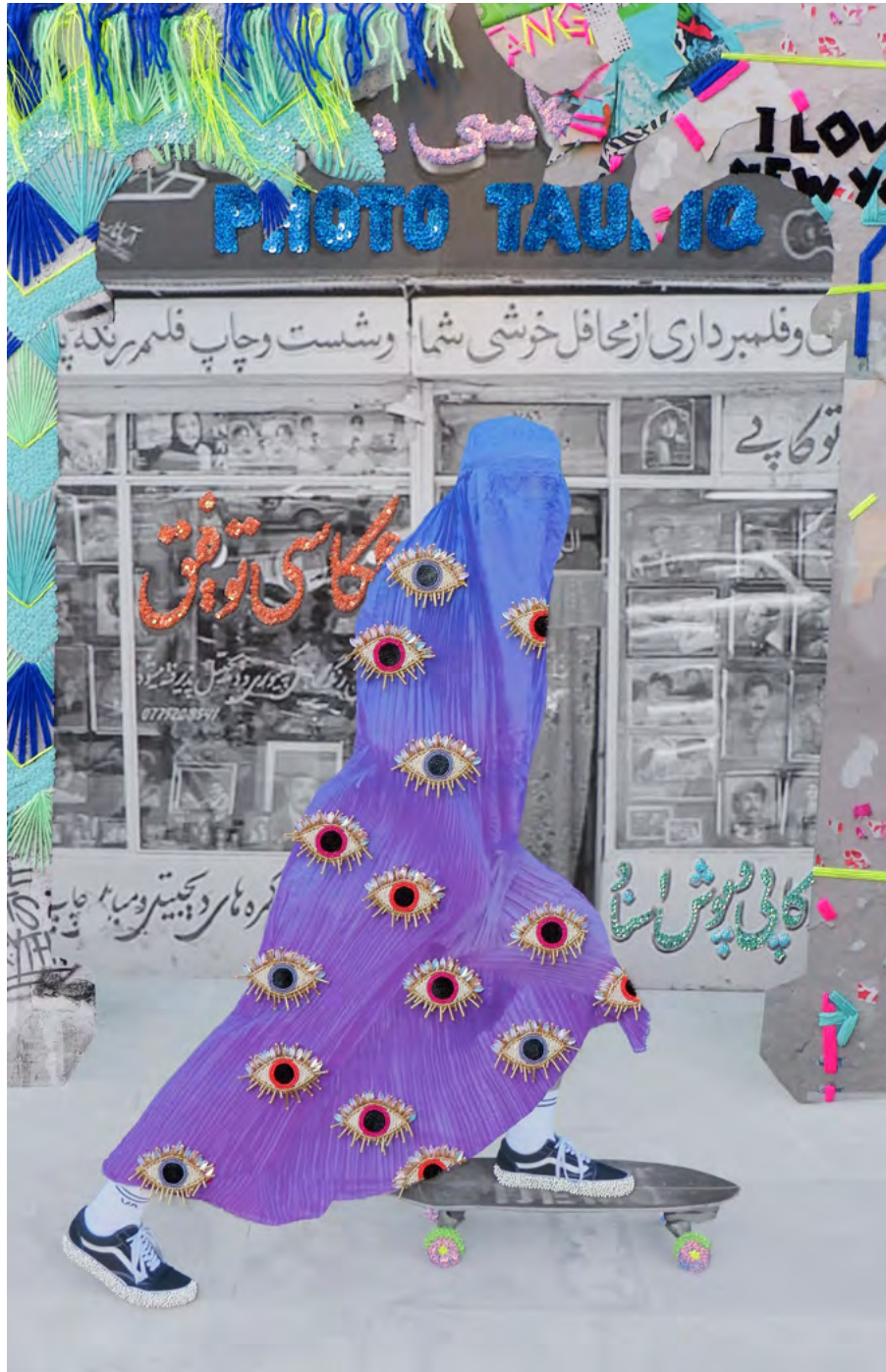
Azaïdé, Aaliya Cruz , 2023, mixed media on canvas, 70 x 45 cm, Limited Edition 1 of 8