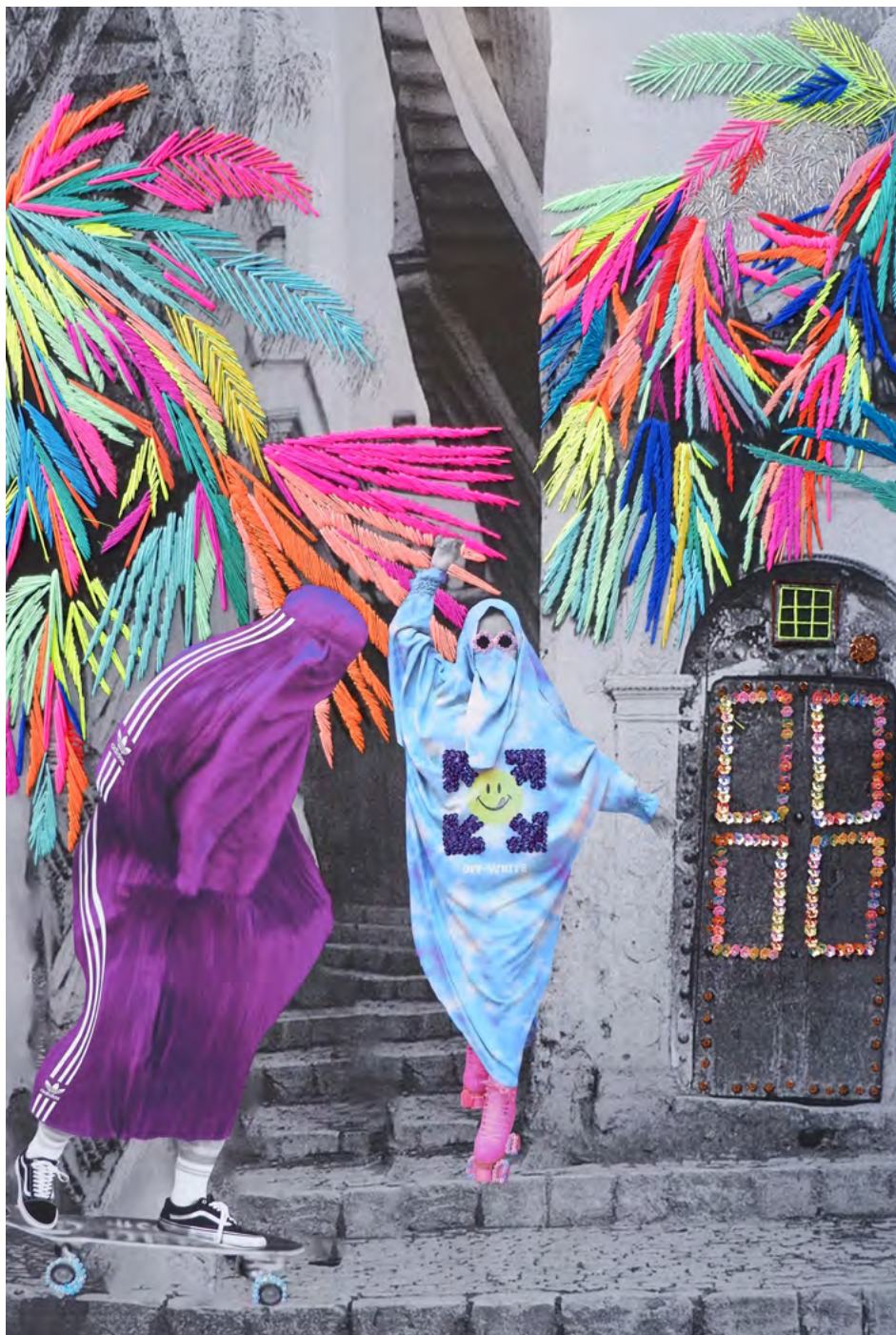
Azaïdé, As7ab and Ryders , 2023, mixed media on canvas, 120 x 80 cm, Limited Edition 1 of 8