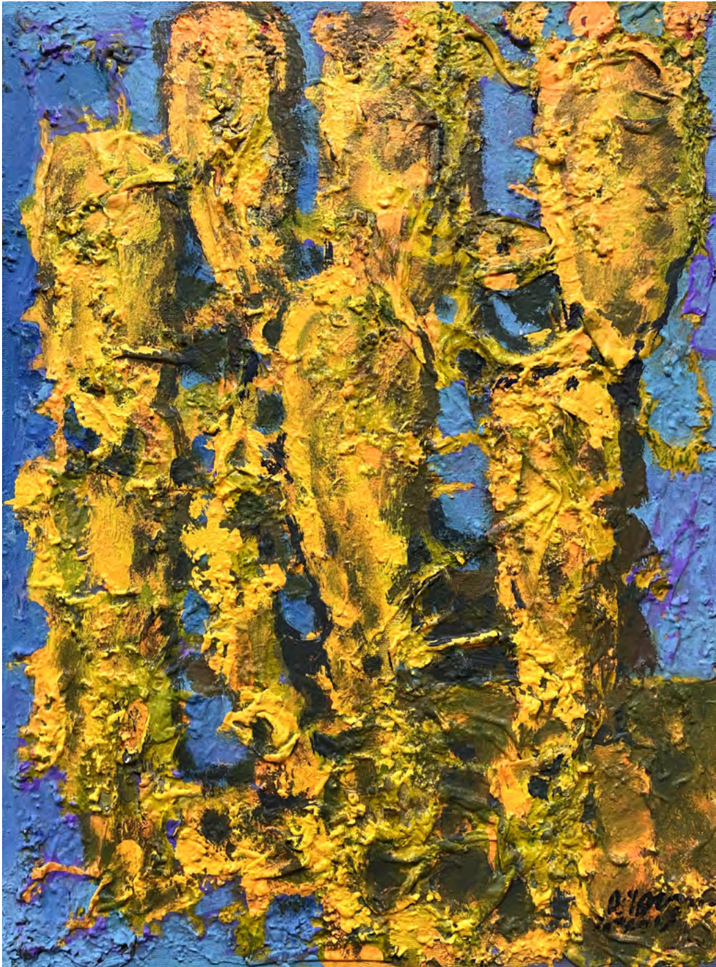
Omran Younes, Untitled 2020, mixed media on canvas, 80 x 60 cm USD 2,800