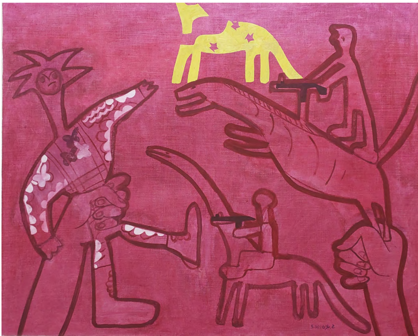
Houssam Ballan, The Monster and the Dinosaur | البيوع والديناصور 2022, oil on canvas, 120 x 150 cm USD 9,000