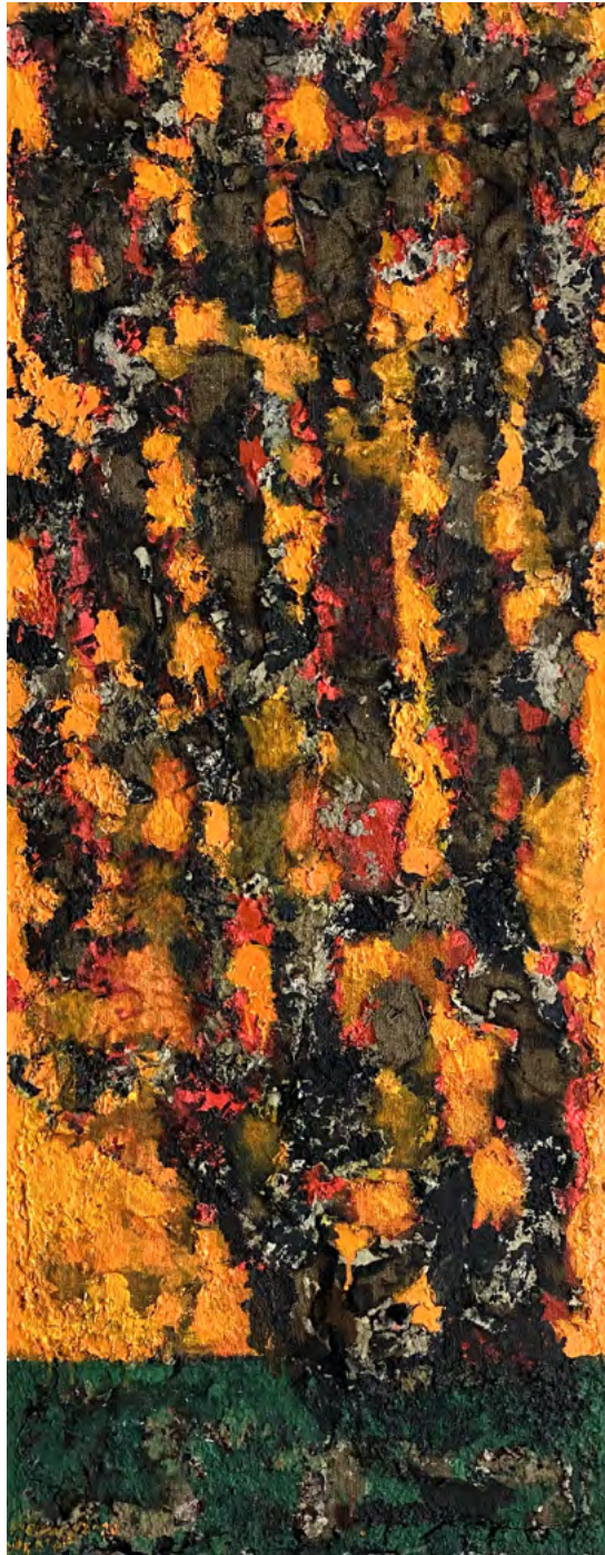
Omran Younes, Untitled 2022, mixed media on canvas, 180 x 70 cm USD 7,500