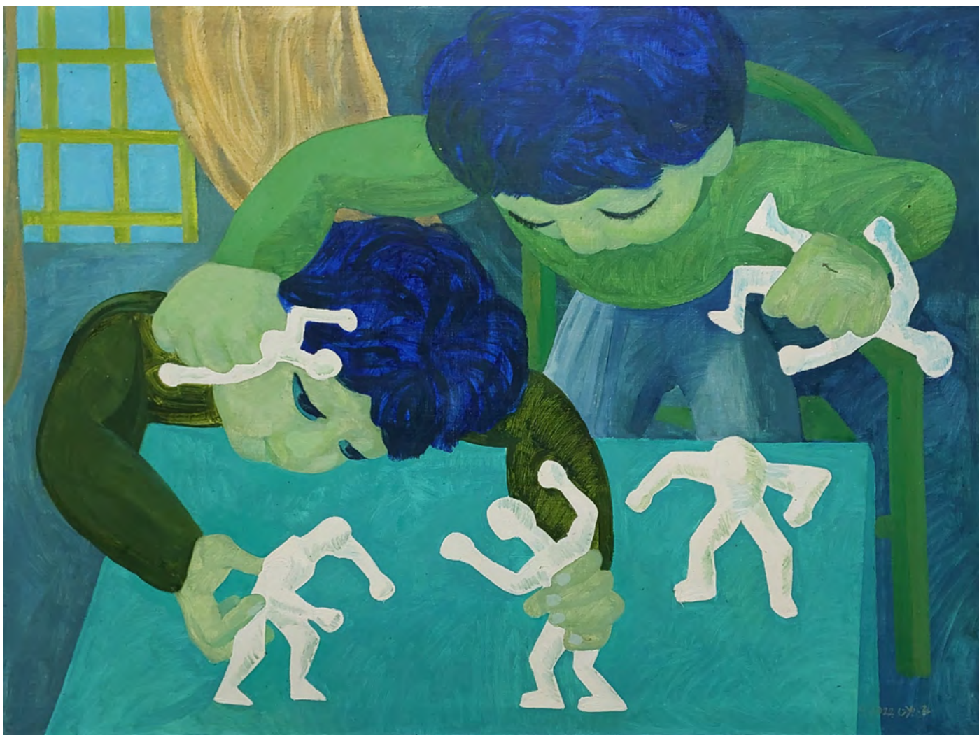
Houssam Ballan, The Toys | الدمى 2022, oil on canvas, 120 x 150 cm USD 9,000