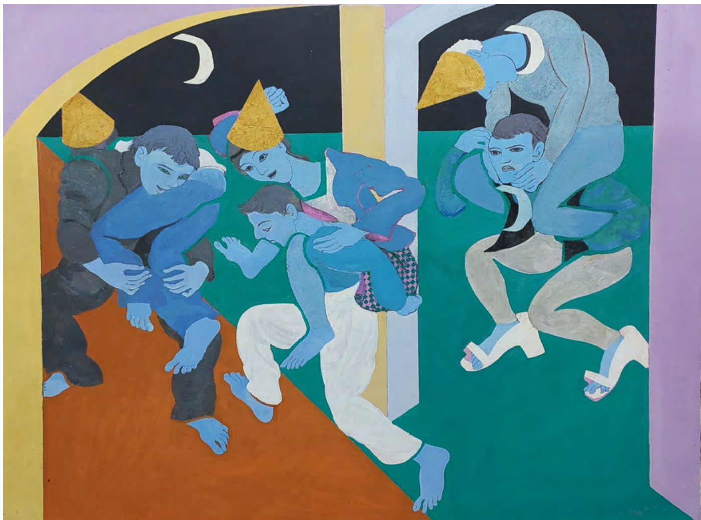
Houssam Ballan, Playing at Suhoor | اللعب وقت السحور 2022, oil on canvas, 130 x 150 cm USD 10,000