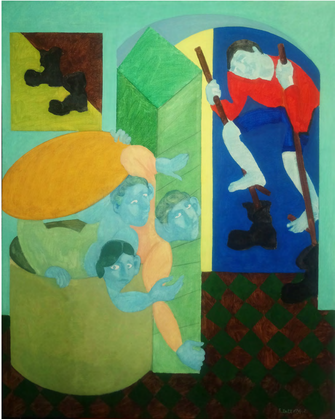
Houssam Ballan, A Game of Hide 'n Seek | لعبة الإختباء 2022, oil on canvas, 150 x 120 cm USD 9,000