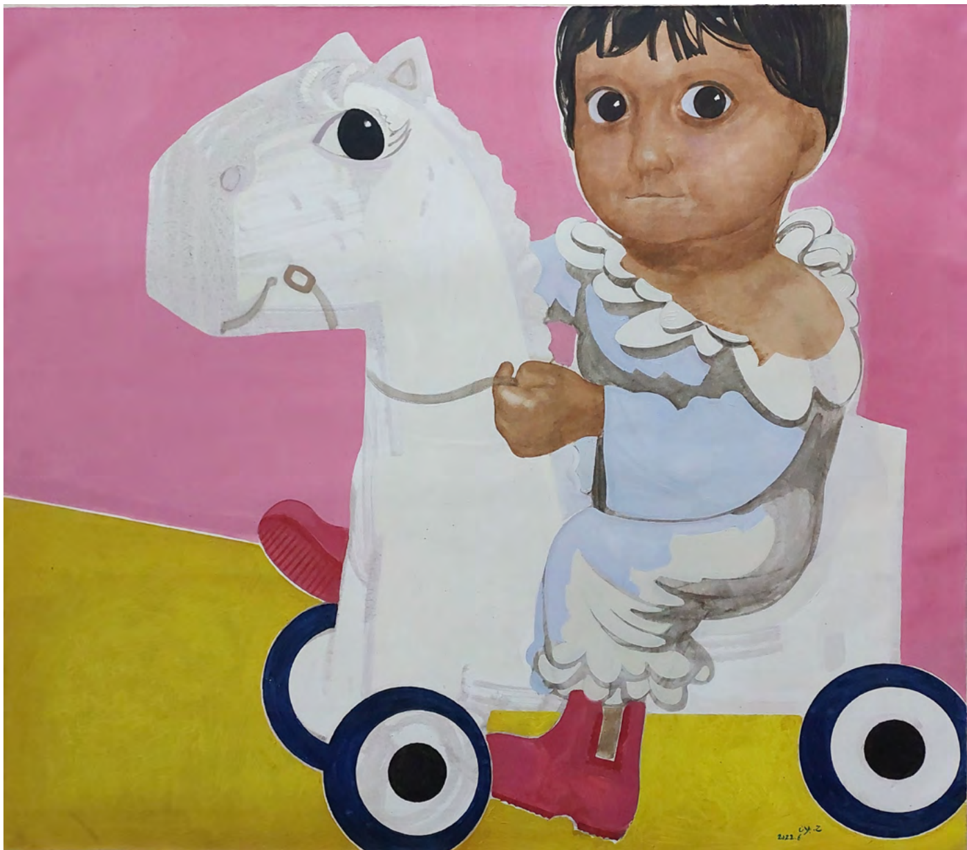
Houssam Ballan, Beirut Corniche Little Girl | فتاة الكورنيش بيروت | 2022, oil on canvas, 130 x 150 USD 10,000