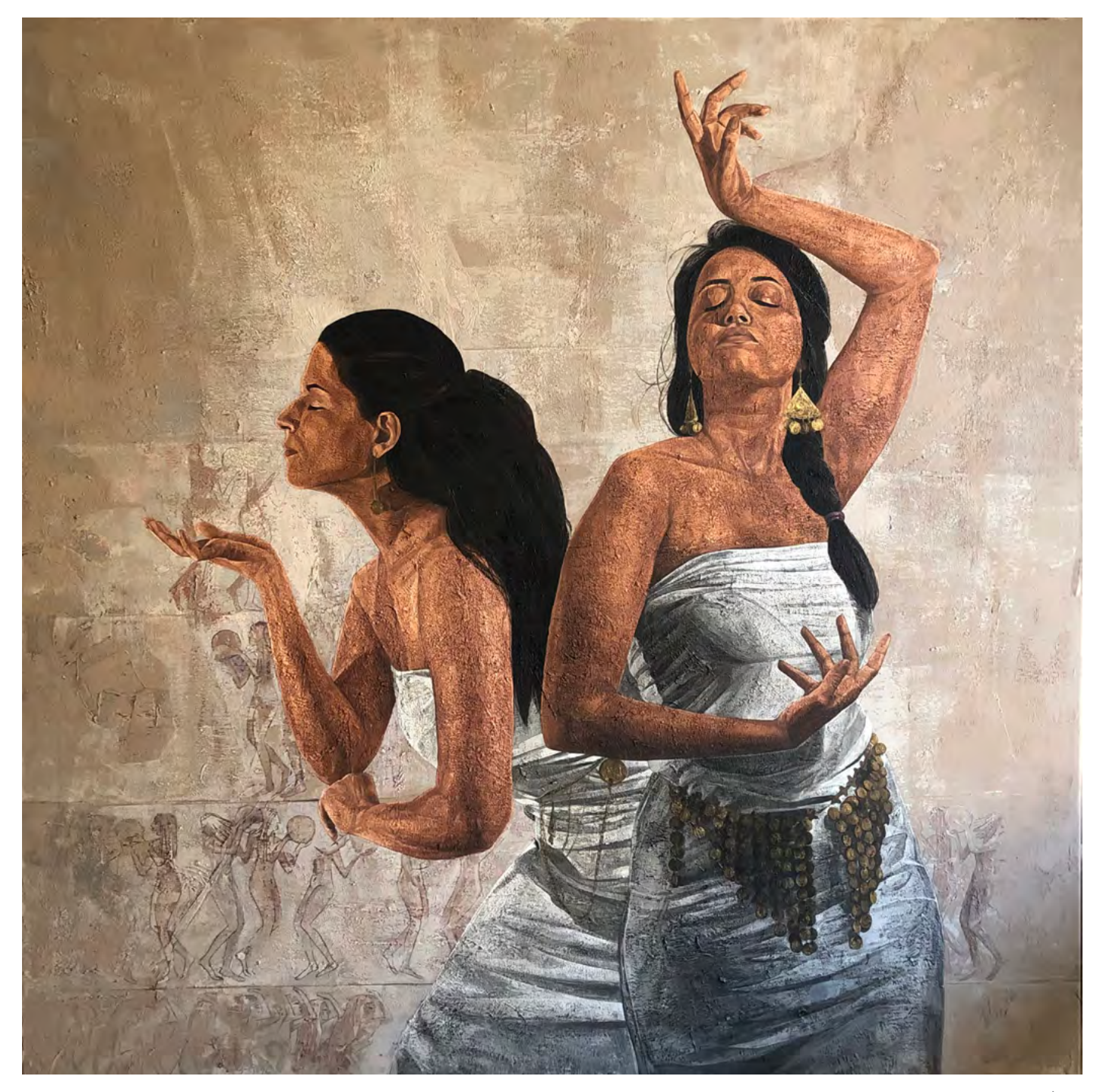
Sara Tantawy, Heirloom | إرث 2022, oil on canvas, 130 x 130 cm AED 12,200 | USD 3,300