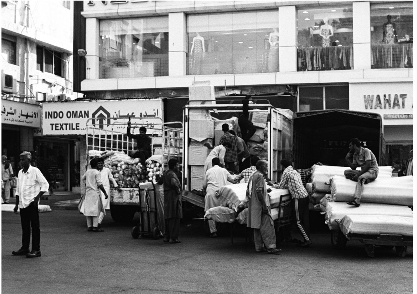
Yamam Nabeel, The Gathering - Dubai, June 2022, Ed. 50, 35mm Photograph on Hahnemule paper, 30 x 42 cm AED 3,000