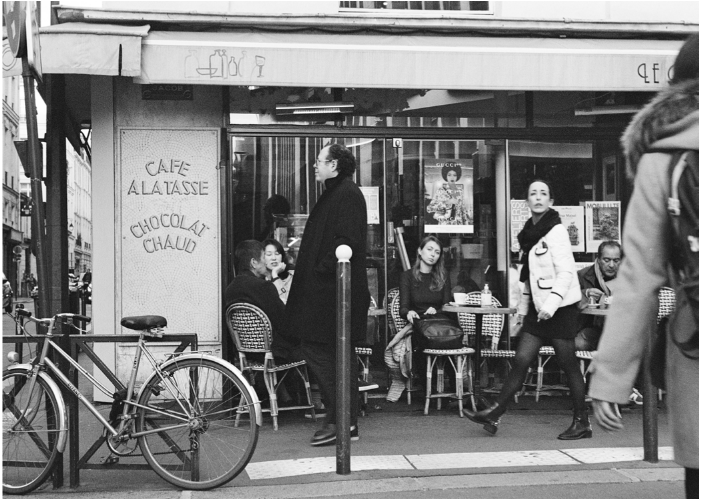
Yamam Nabeel, Comme d'habitude - Paris, October 2021, 35mm Photograph on Hahnemule paper, 21 x 30 cm AED 2,500