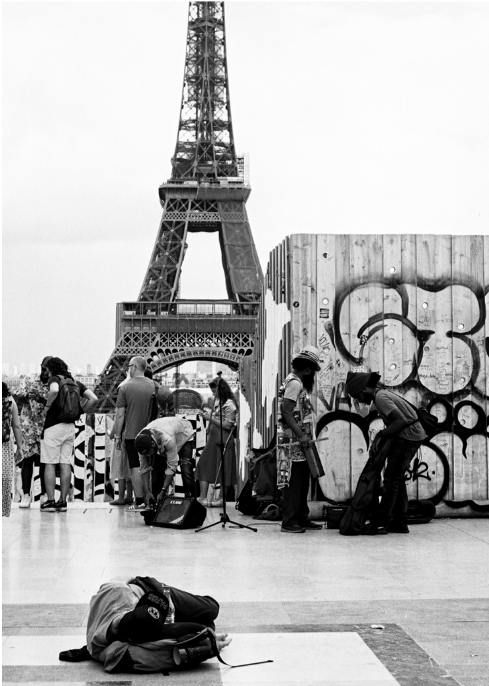
Yamam Nabeel, Hide the Truth - Paris, France - August 2022, Ed. 50, 35mm Photograph on Hahnemule paper, 30 x 42 cm AED 4,000