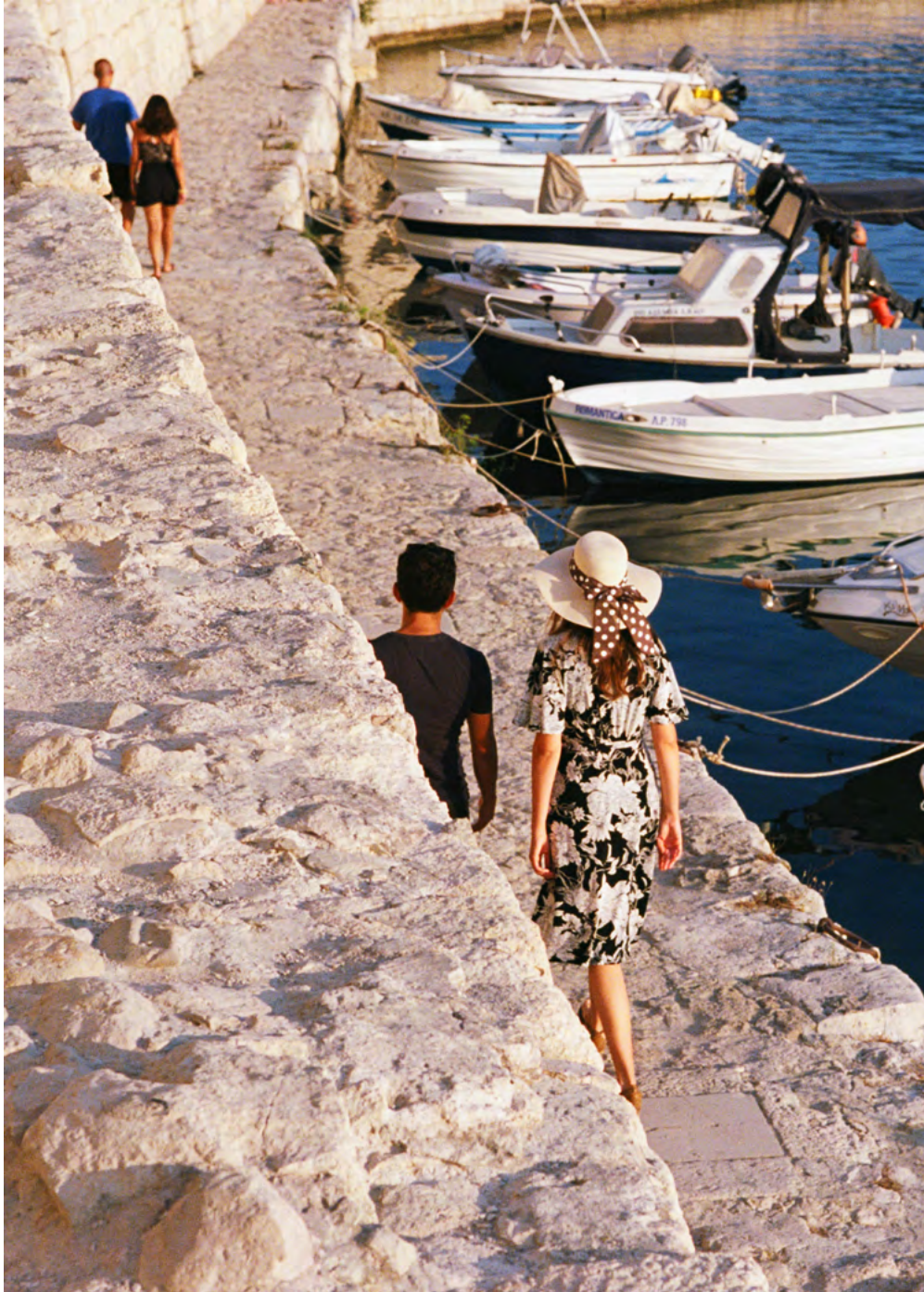
Yamam Nabeel, If You Only Knew - Rethimno, Crete, Greece. August 2021, Ed. 50, 35mm Photograph on Hahnemule paper, 30 x 42 cm