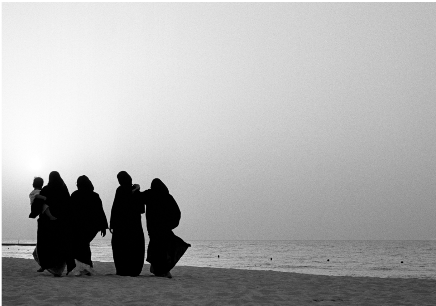
Yamam Nabeel, Behind the Sunset. Abu Dhabi, May 2022, Ed. 5, 35mm Photograph on Hahnemule paper, 84 x 119 cm AED 10,000