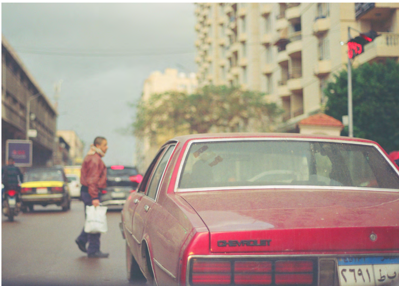
Yamam Nabeel, The Divide. - Alexandria, Egypt. January 2020, Ed. 10, 35mm Photograph on Hahnemule paper, 60 x 84 cm AED 7,500