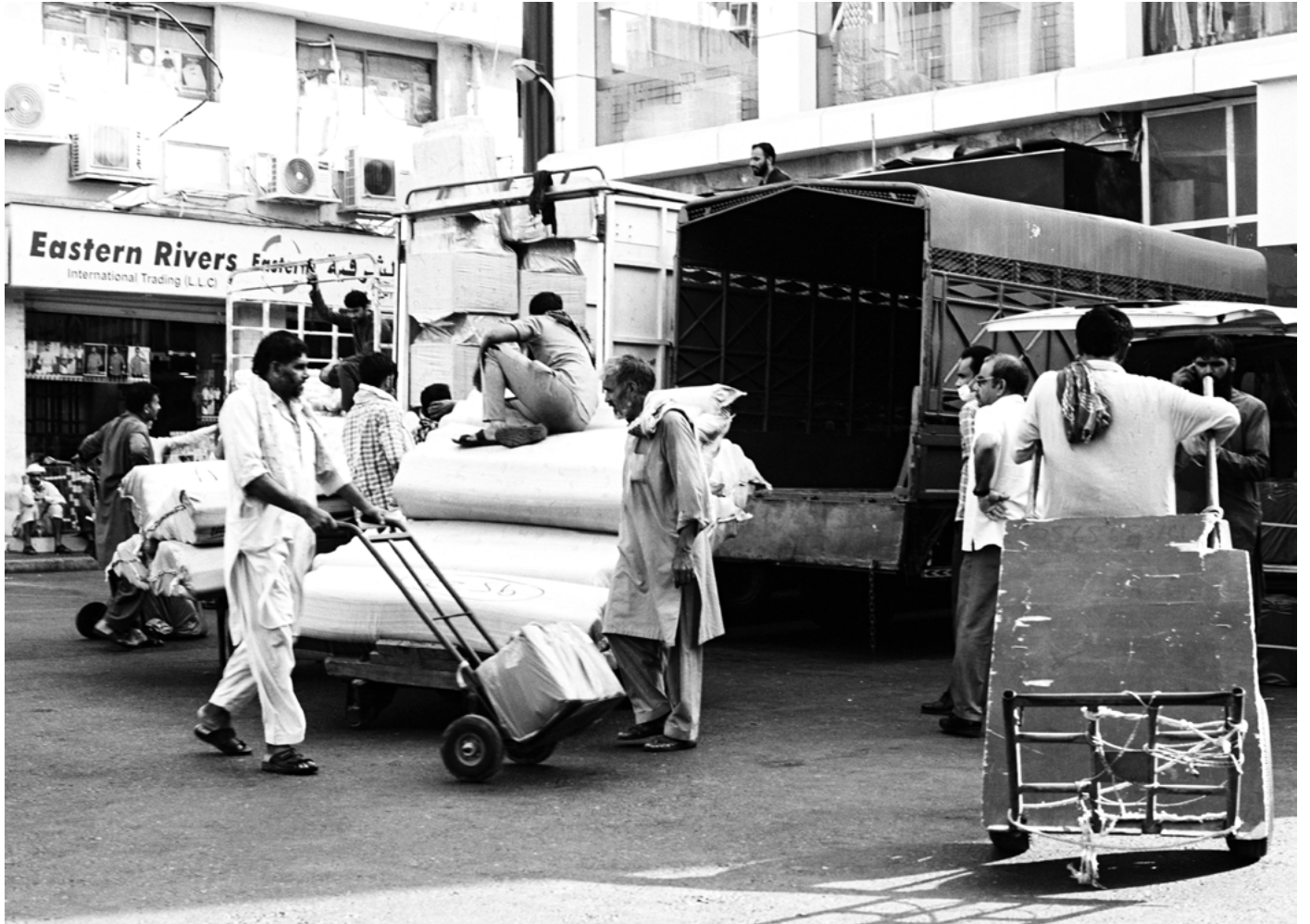
Yamam Nabeel, Rivers Crossed - Dubai, UAE. June 2022, 35mm Photograph on Hahnemule paper, 21 x 30 cm AED 2,500