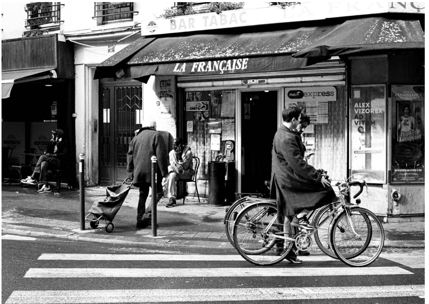
Yamam Nabeel, Smokeless - Paris, France. October 2022, Ed. 20, 35mm Photograph on Hahnemule paper, 42 x 60 cm AED 6,000