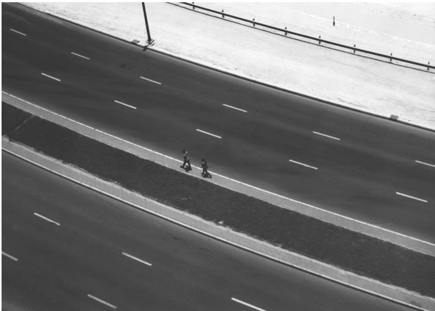
Yamam Nabeel, Alone, together II - Dubai, June 2022, Ed. 50, 35mm Photograph on Hahnemule paper, 30 x 42 cm AED 3,000