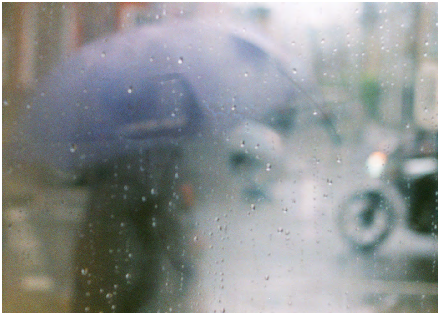
Yamam Nabeel, Behind My Dream. London, UK. March 2020, Ed. 20, 35mm Photograph on Hahnemule paper, 42 x 60 cm AED 6,000