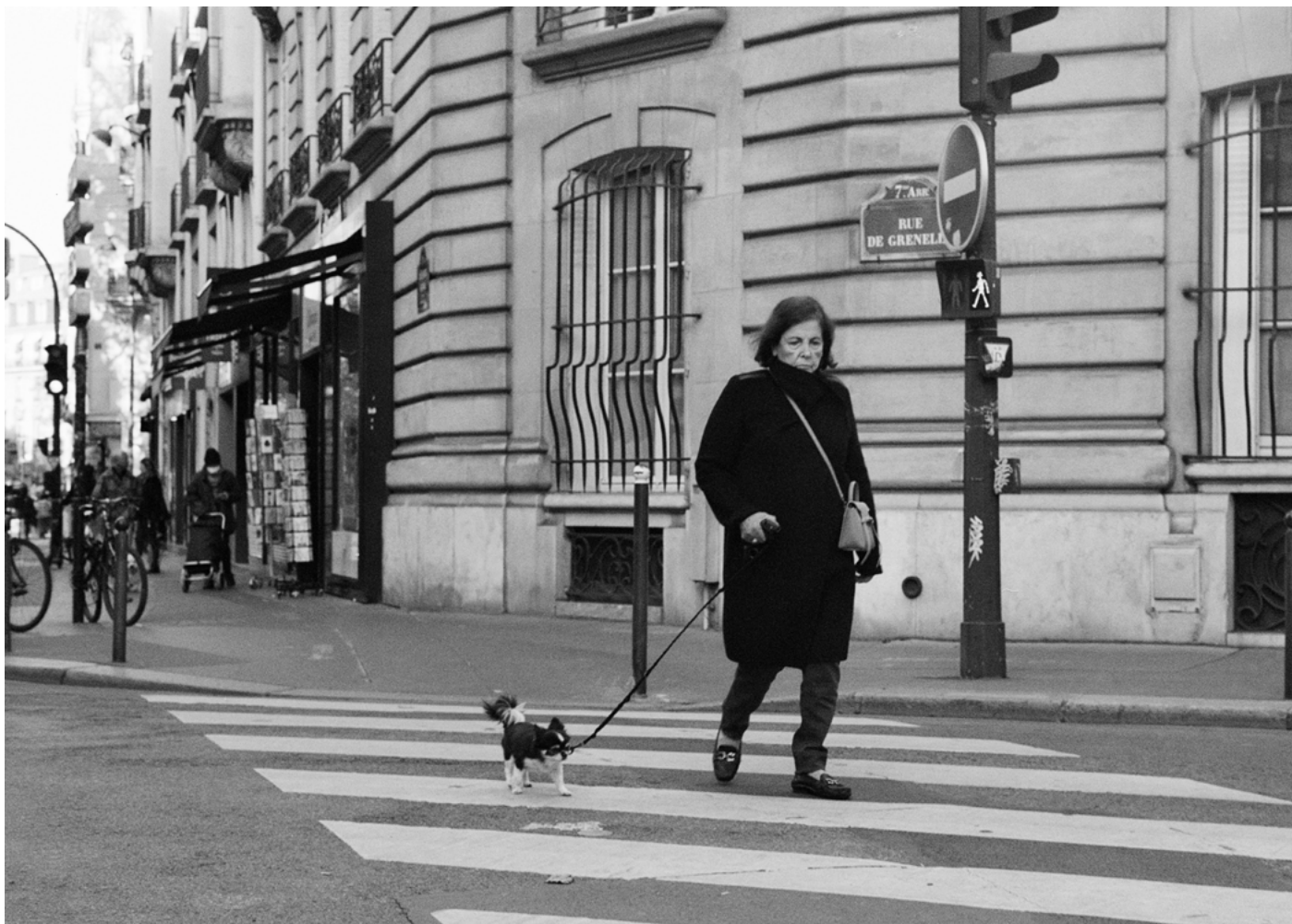
Yamam Nabeel, The Daily Walk - Paris, France. October 2021, Ed. 20, 35mm Photograph on Hahnemule paper, 42 x 60 cm AED 6,000