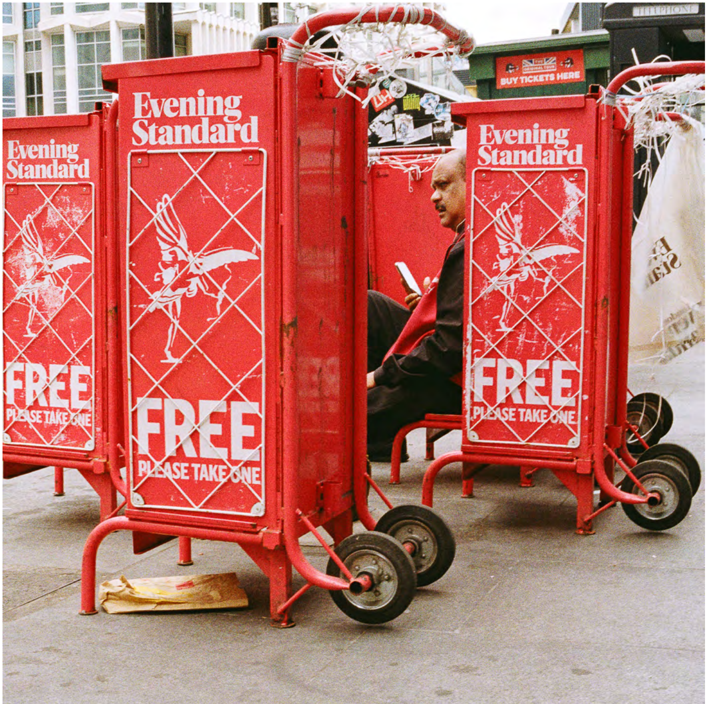
Yamam Nabeel, Behind the News - London, UK. July 2020, Ed. 5, 35mm Photograph on Hahnemule paper, 60 x 60 cm AED 7,500