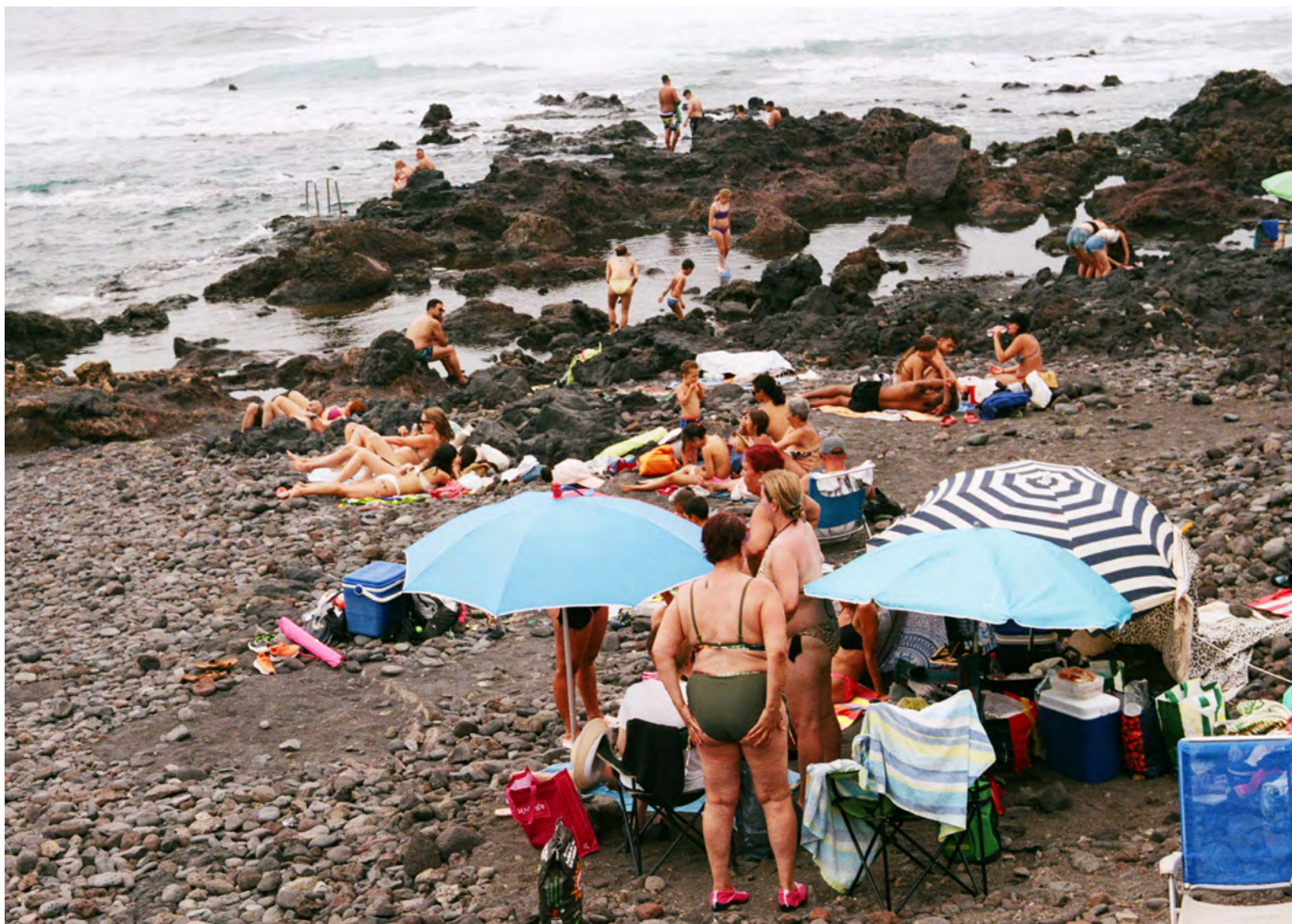
Yamam Nabeel, This is Us - San Cristobal de La Laguna, Tenerife, Spain . July 2022, 35mm Photograph on Hahnemule paper, 21 x 30 cm AED 2,500