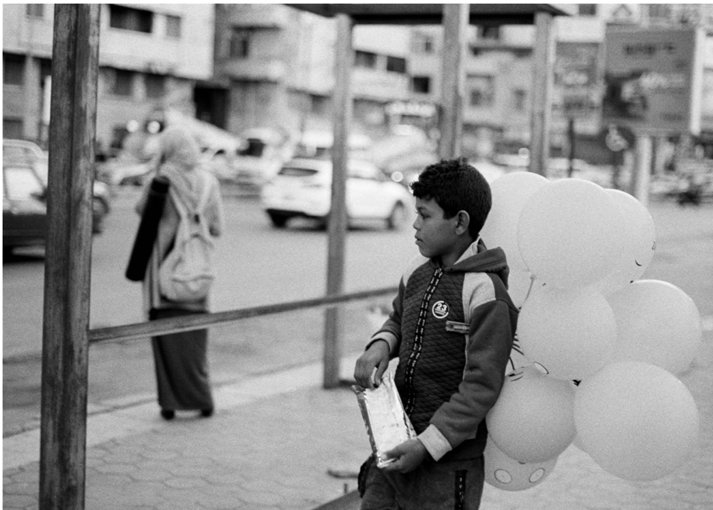
Yamam Nabeel, One of Those Days - Alexandria, Egypt. January 2020, Ed. 10, 35mm Photograph on Hahnemule paper, 60 x 84 cm AED 7,500