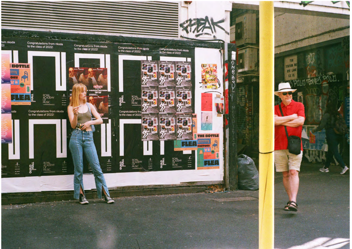
Yamam Nabeel, Things that Divide - London, UK. July 2022, 35mm Photograph on Hahnemule paper, 21 x 30 cm AED 2,500