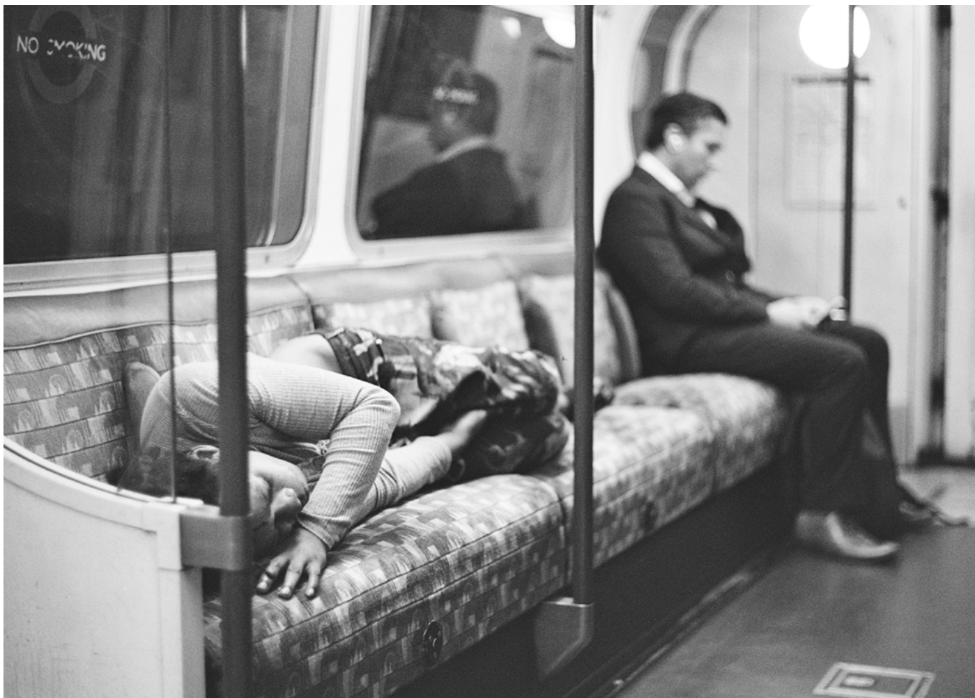
Yamam Nabeel, Worlds Apart, London 2022, Ed. 20, 35mm Photograph on Hahnemule paper, 42 x 60 cm AED 6,000