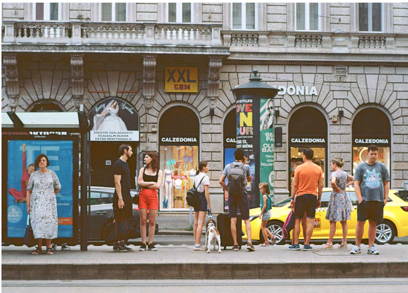
Yamam Nabeel, All Sorts - Budapest, Hungary. August 2022, Ed. 5, 35mm Photograph on Hahnemule paper, 21 x 30 cm AED 2,500