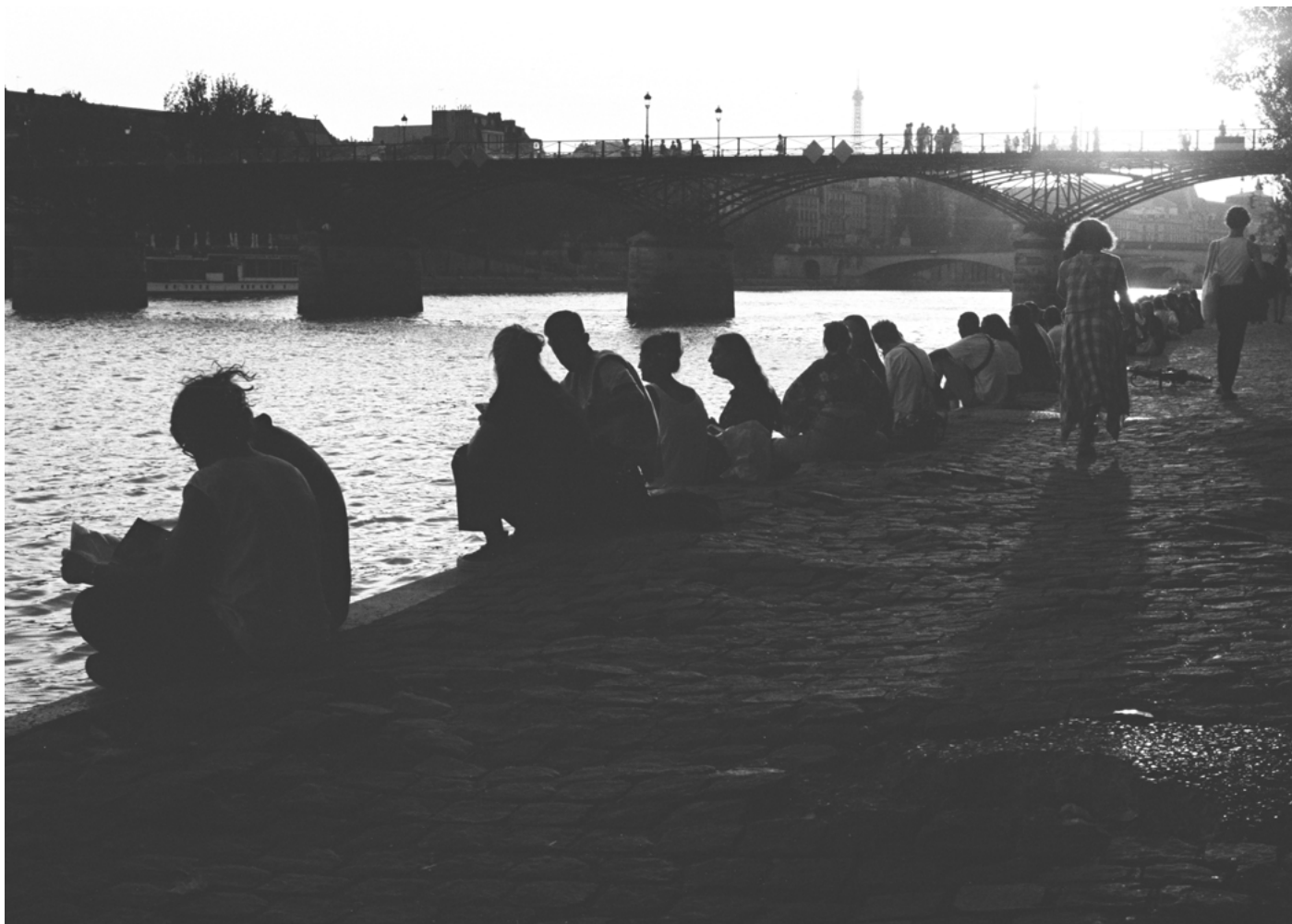
Yamam Nabeel, Together. Alone. - Paris France, August 2022, Ed. 50, 35mm Photograph on Hahnemule paper, 30 x 42 cm AED 4,000