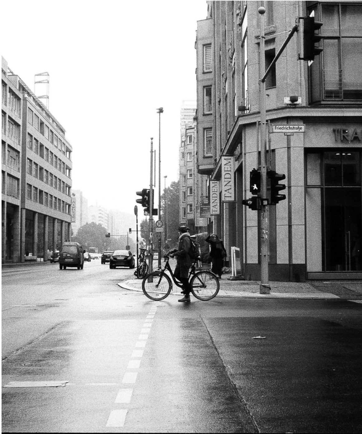
Yamam Nabeel, Lockdown - Berlin, Germany. October 2020, Ed. 5, 35mm Photograph on Hahnemule paper, 120 x 95 cm AED 10,000