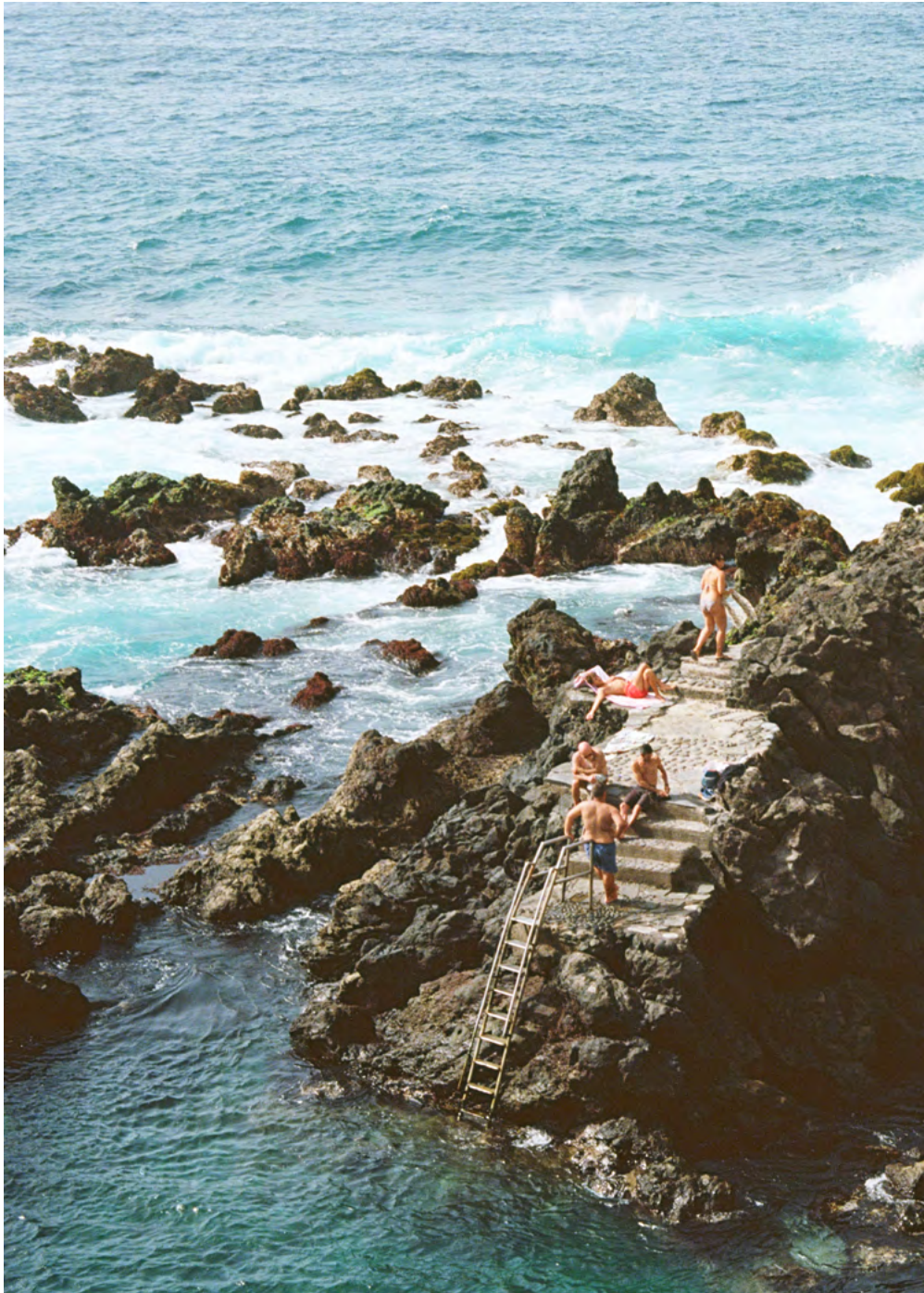
Yamam Nabeel, This Might not be a Dream - Puerto de la Cruz, Tenerife, Spain . July 2022, Ed. 20, 35mm Photograph on Hahnemule paper, 42 x 60 cm