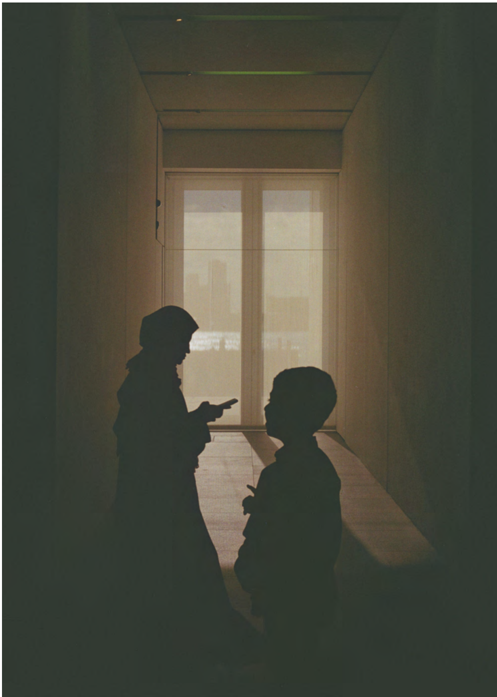
Yamam Nabeel, Searching Again - Abu Dhabi, December 2019, Ed.20, 35mm Photograph on Hahnemule paper, 42 x 60 cm AED 5,000