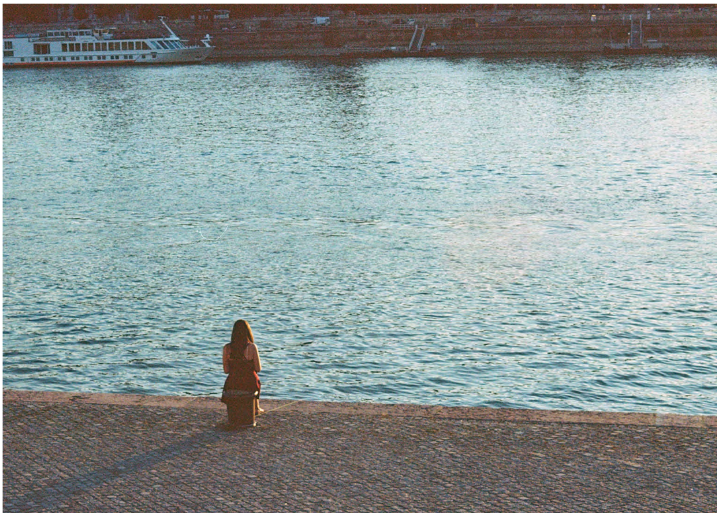
Yamam Nabeel, Forgotten Lullaby - Budapest August 2022, Ed. 20, 35mm Photograph on Hahnemule paper, 42 x 60 cm AED 5,000