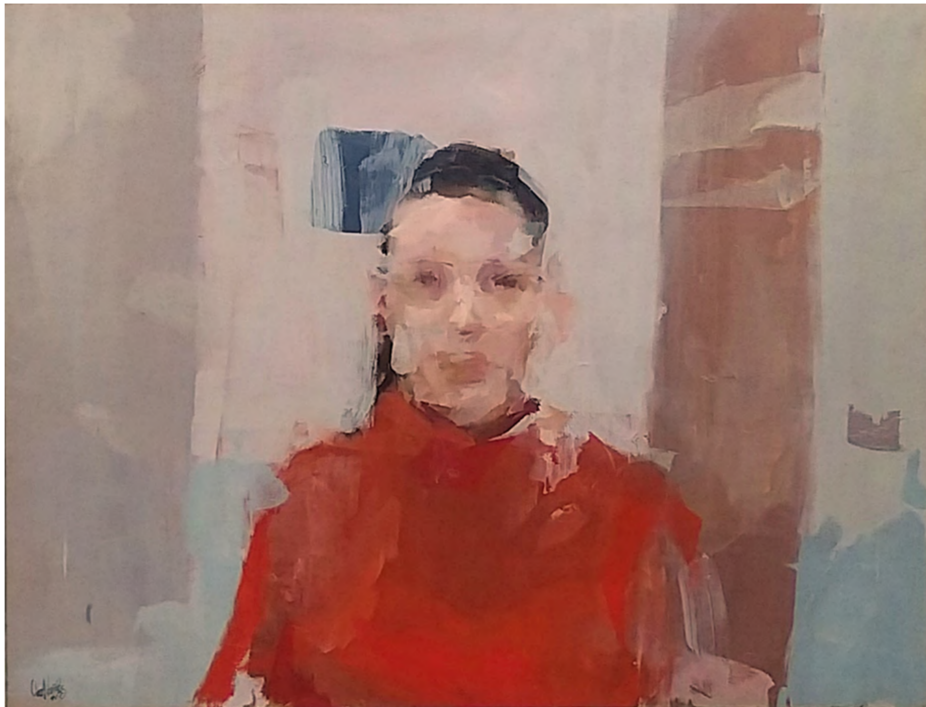
Omar Najjar, Untitled, oil on canvas, 85 x 65 cm JOD 2,100 | USD 3,000