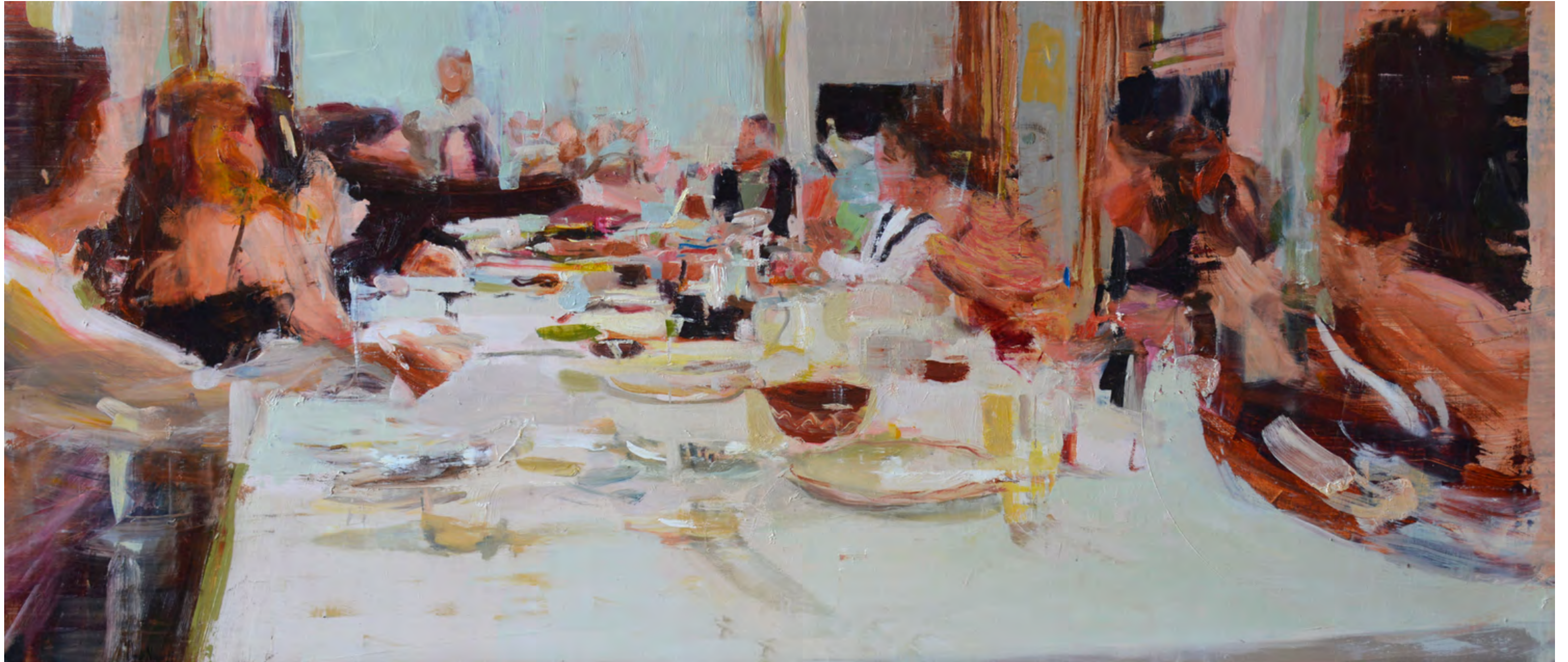
Omar Najjar, Untitled, 2021, oil on canvas, 120 x 70 cm JOD 2,500 | USD 3,500