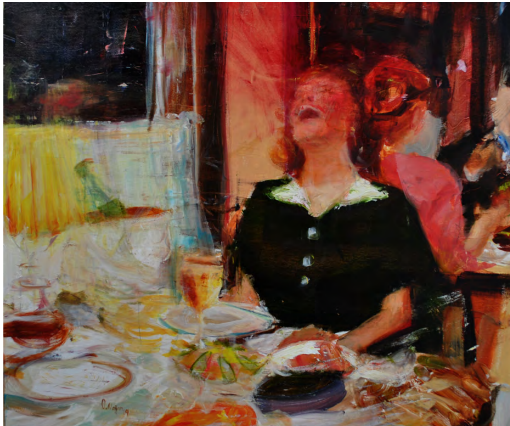
Omar Najjar, Miserable , 2018, oil on canvas, 75 x 90 cm JOD 2,100 | USD 3,000