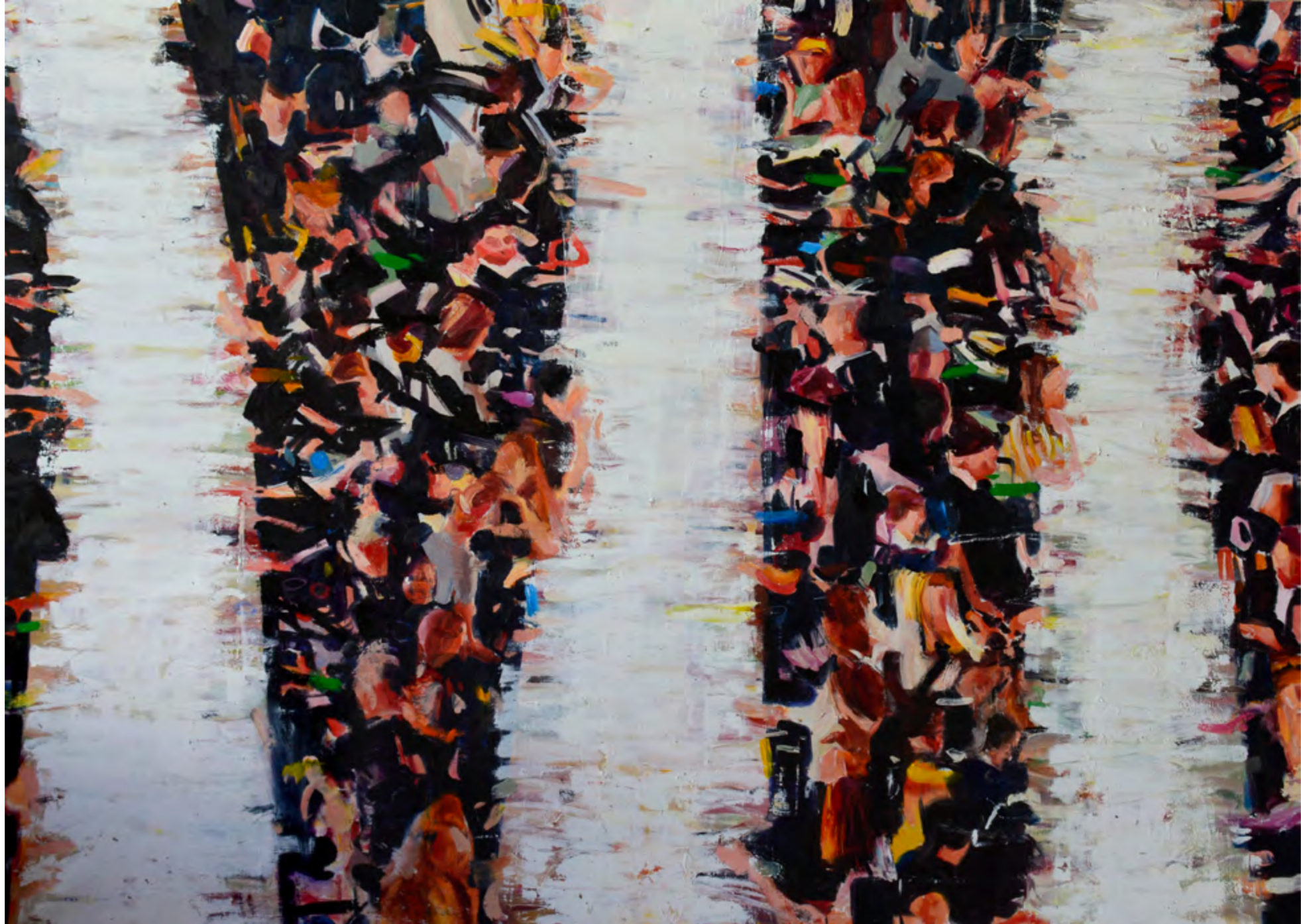
Omar Najjar, People , 2021, oil on canvas, 165 x 120 cm JOD 4,000 | USD 3,500